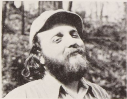
WILL — (George Strunk) is the sheriff of the town and pushing 60.