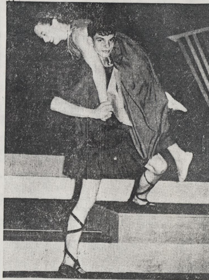
Petruchio Takes a Bride

The College Players make no admission charge for their shows, and present them to stimulate interest in live theatre in Lock Haven. The curtain will go up again tonight at 8.15.