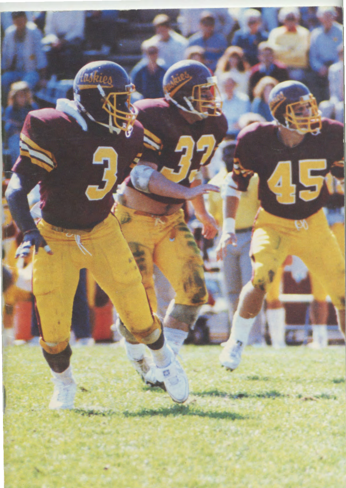
Bloomsburg Football '88