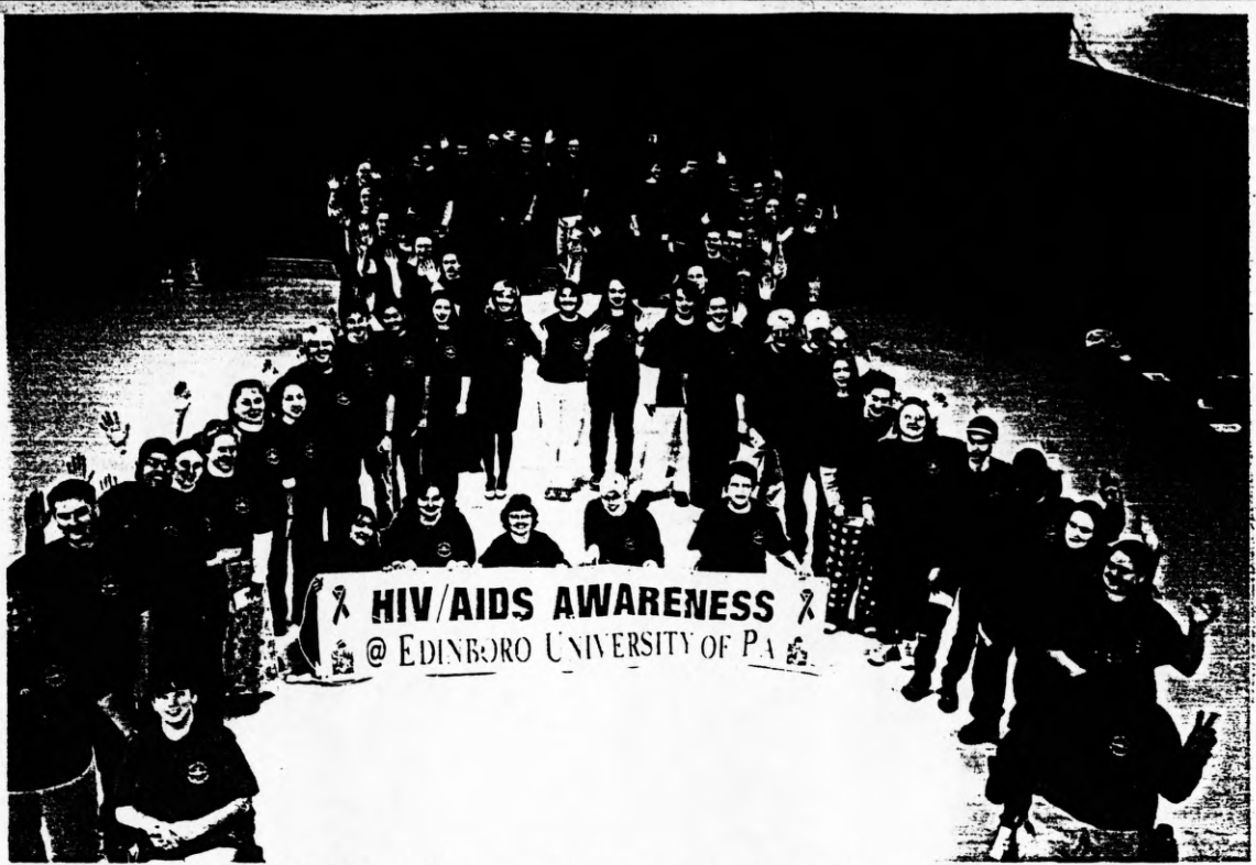
Students at Edinboro University of Pennsylvania form a human AIDS ribbon in the University Center to mark World AIDS Day. The University provided several AIDS-related services during its observance of the event including free HIV testing at Ghering Health Center, information about HIV prevention, and a display of panels from the NAMES project AIDS memorial quilt.