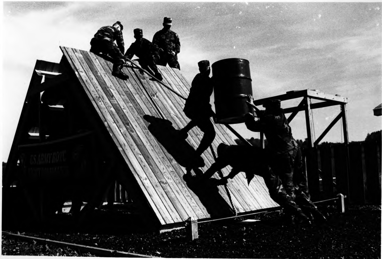
Cadets from Edinboro University's ROTC program demonstrate teamwork on one of the two modules of the new leadership reaction course.