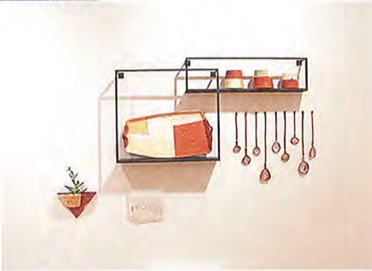
Didem Mert's Pottery