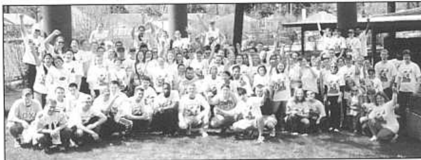
Edinboro students participated in the 2002 Walk America to benefit the March of Dimes.