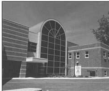
Crawford Center for Health and Physical Education and Disability Resources