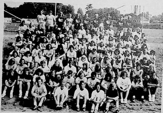
"Commitment to Excellence" Campers