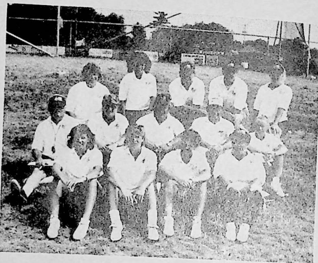
"Commitment to Excellence" Teaching and Coaching Staff

50 YEARS PLUS TEACHING SOFTBALL PLAYERS OF ALL AGES