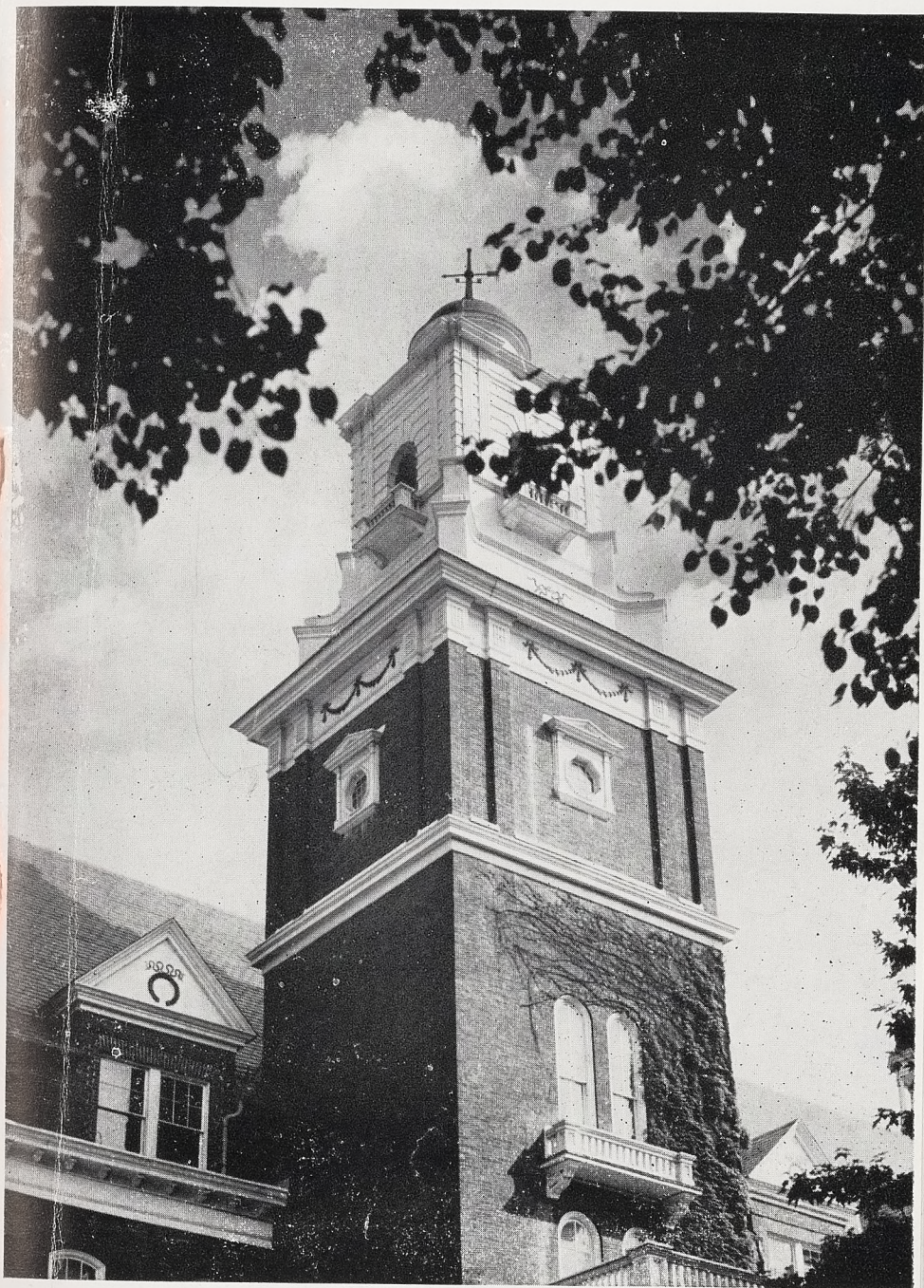
TOWER OF "OLD MAIN"