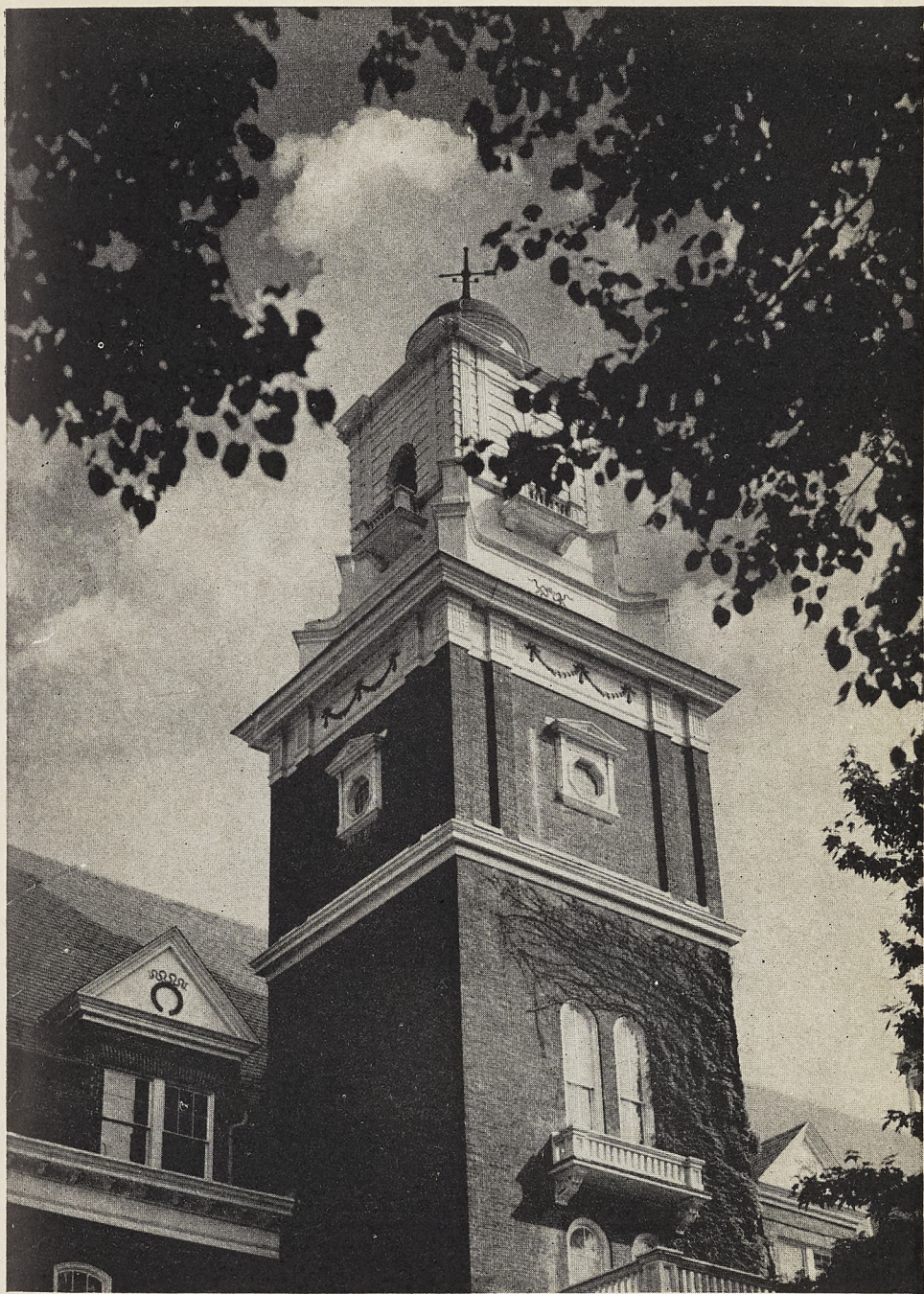
TOWER OF "OLD MAIN"