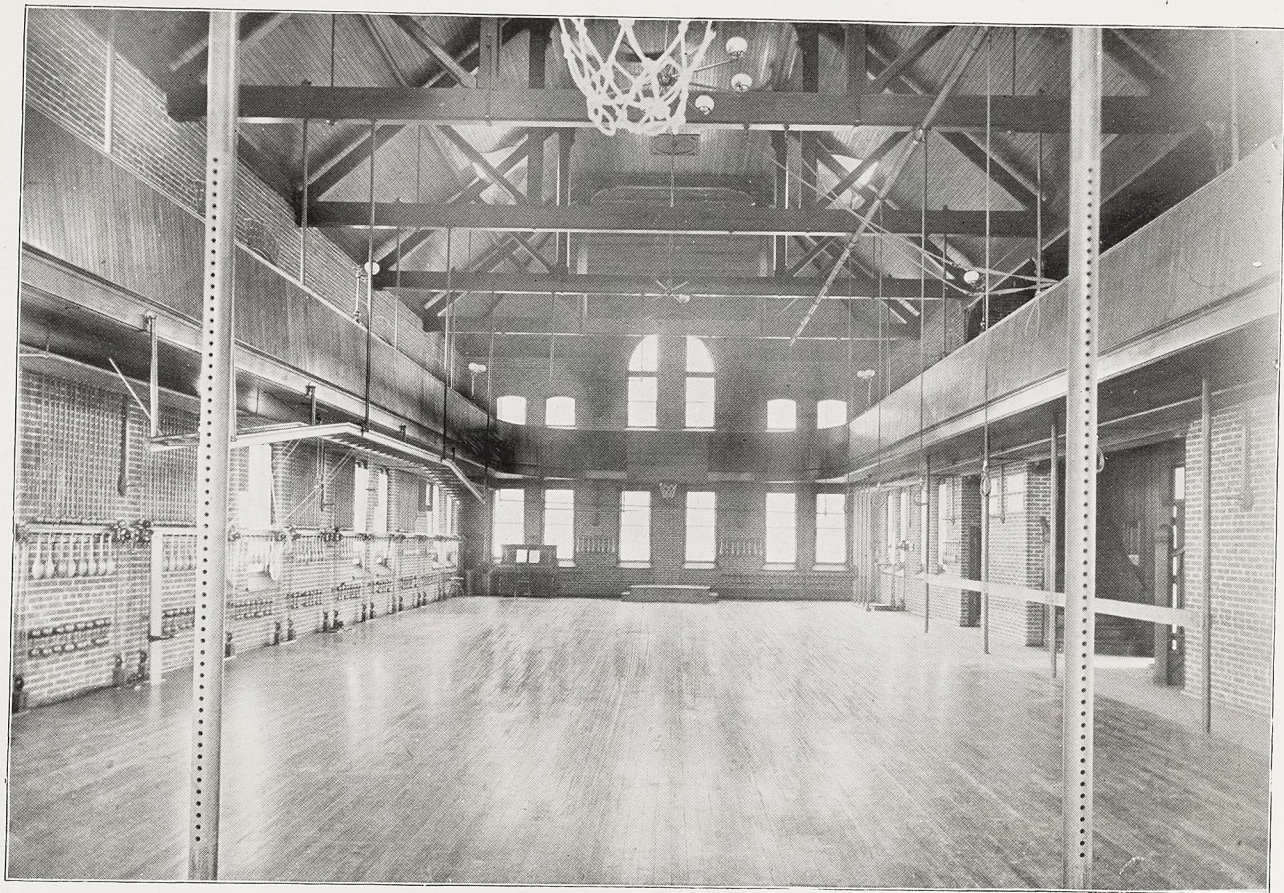
INTERIOR OF GYMNASIUM