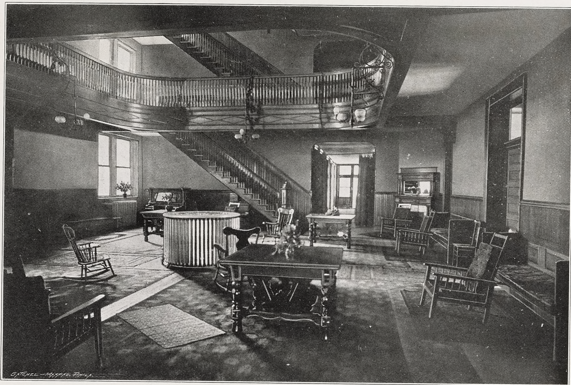
COURT OF GIRLS' DORMITORY: REAR VIEW