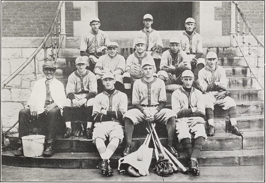
THESE UPHOLD NORMAL ON THE BASEBALL FIELD