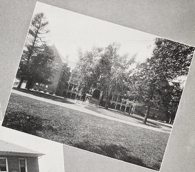
THE ADMINISTRATION BUILDING