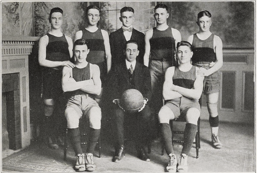
BASKETBALL TEAM, 1920