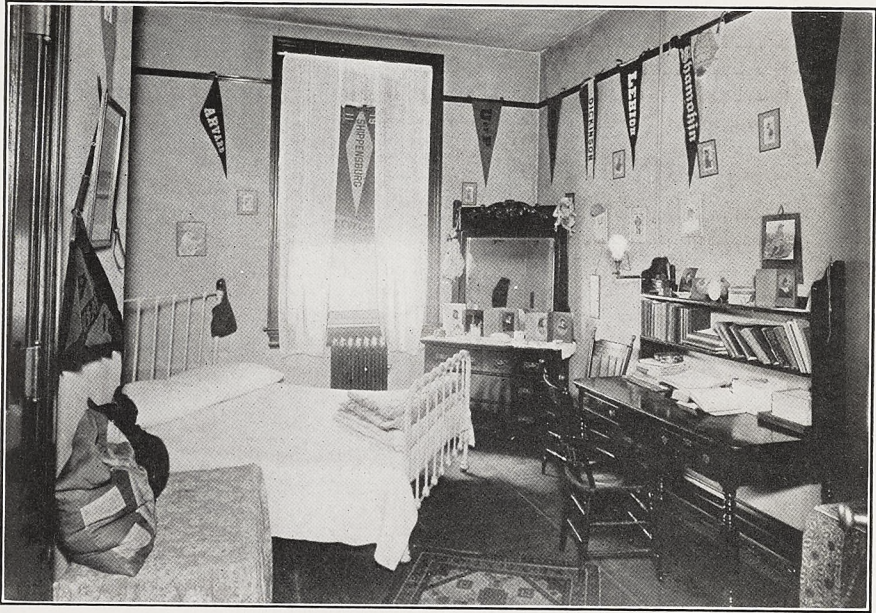
ROOMS IN THE GIRLS' DORMITORY