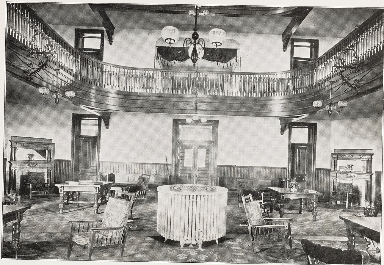
COURT OF GIRLS' DORMITORY