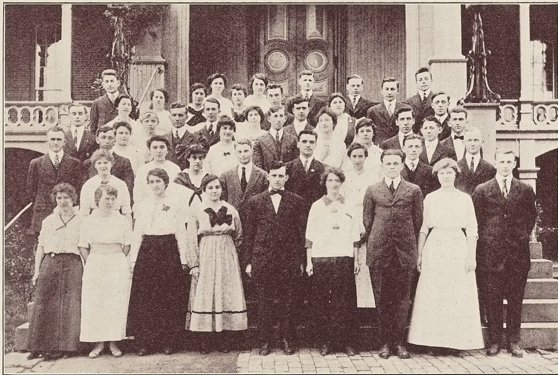
These Live in Adams County.