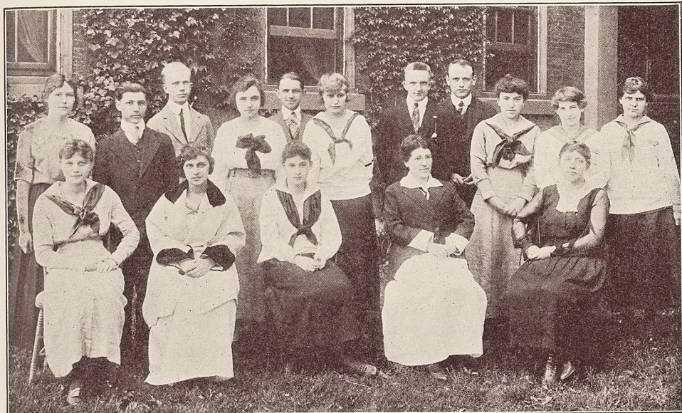
From Lehigh County and the Sunny South.