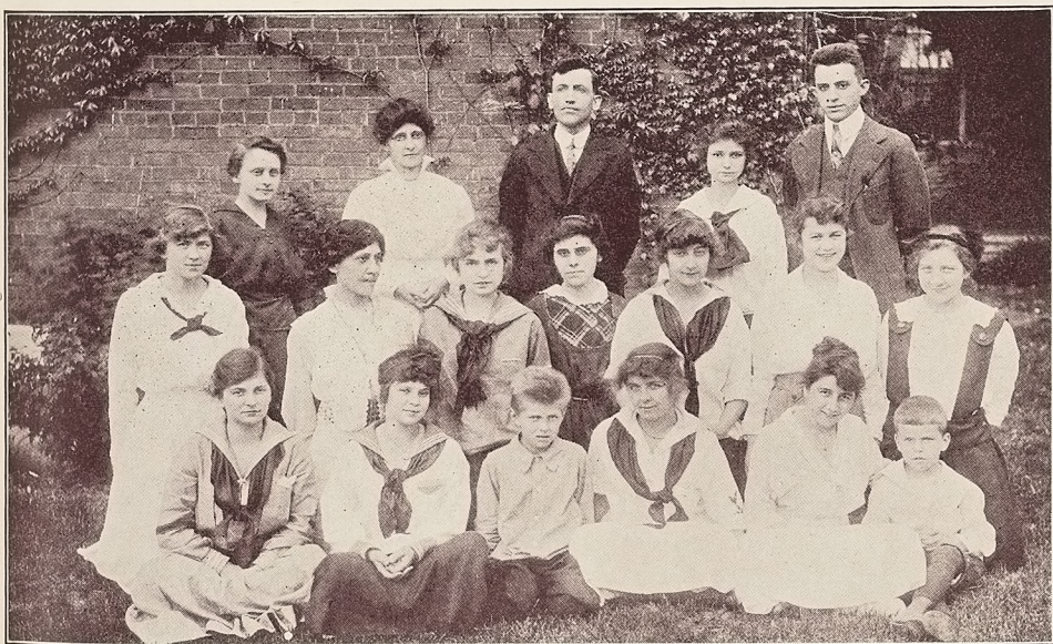
These Call Dauphin County Their Home.