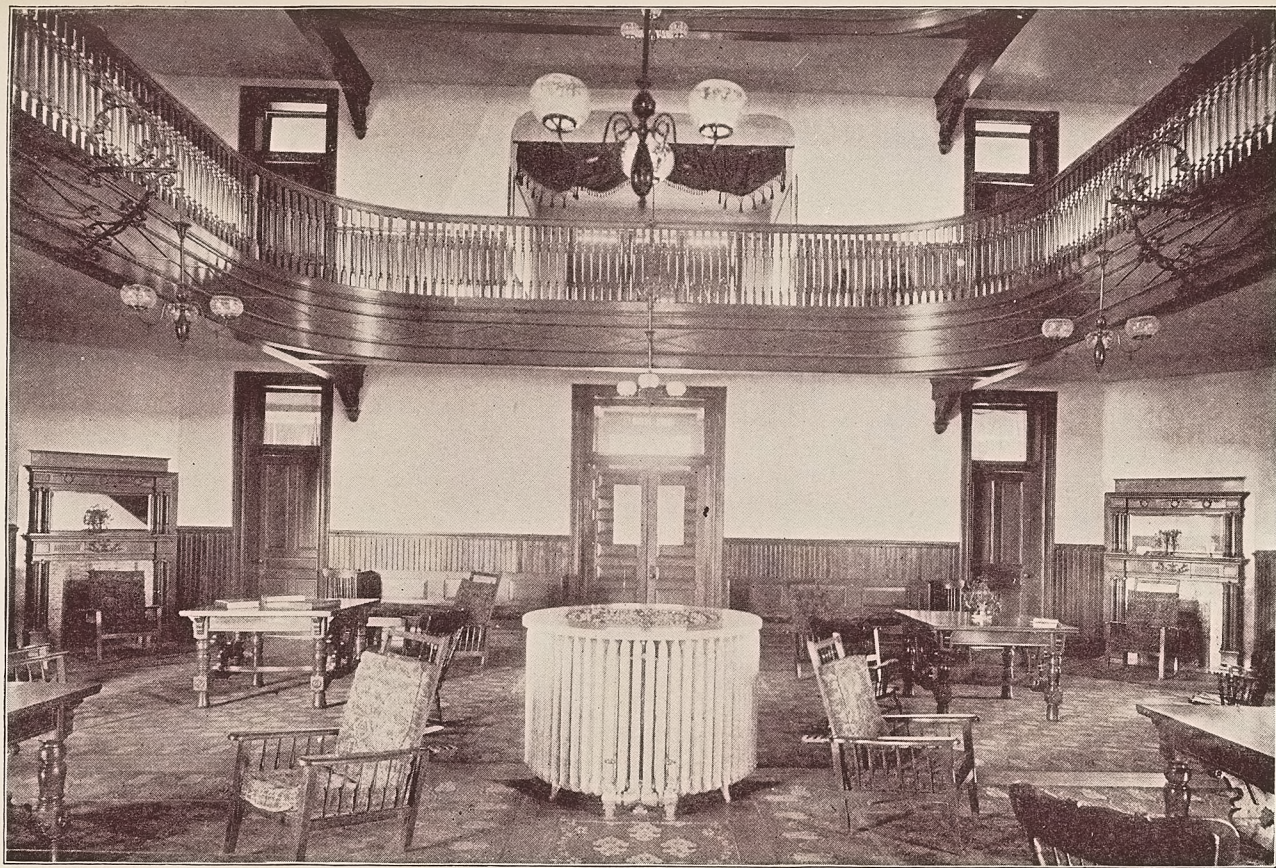
Court of Girls' Dormitory.