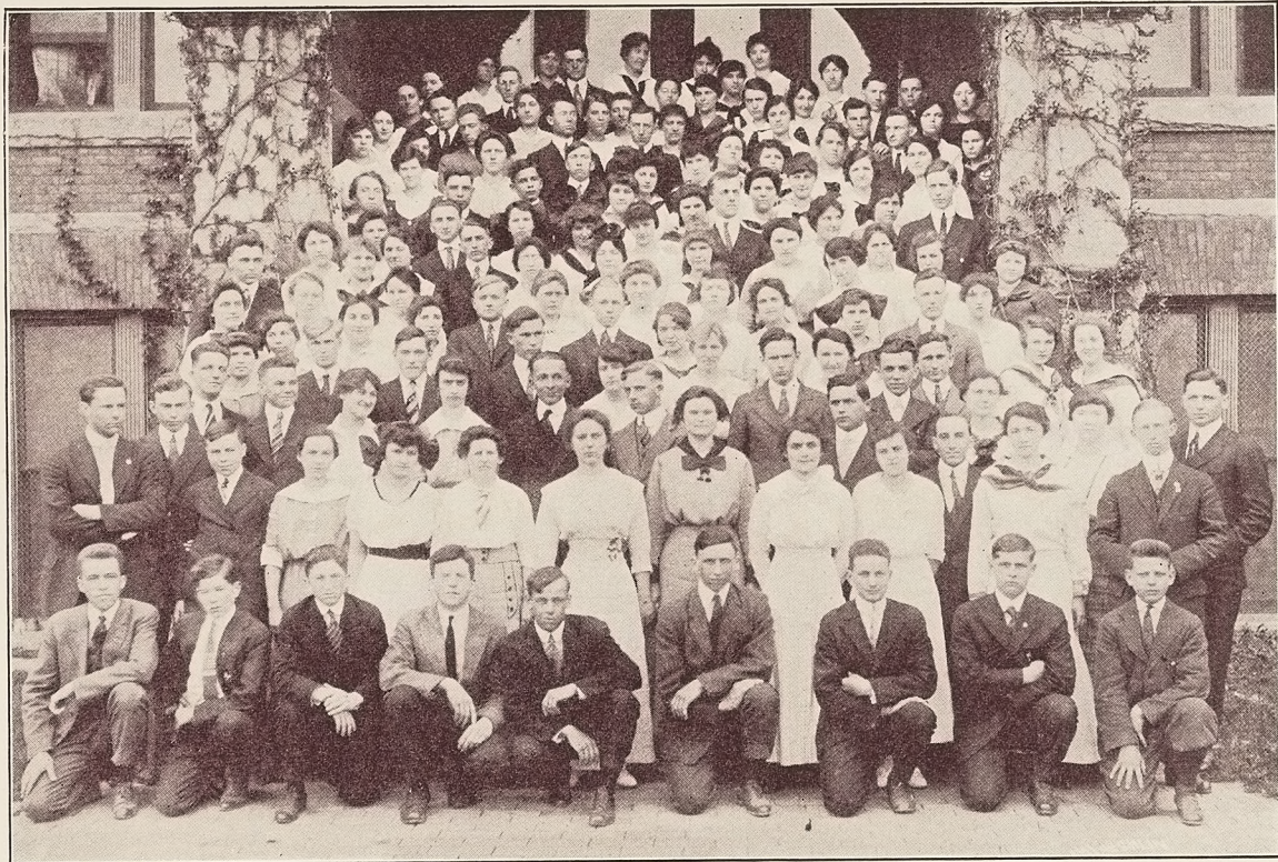
Franklin County Students.