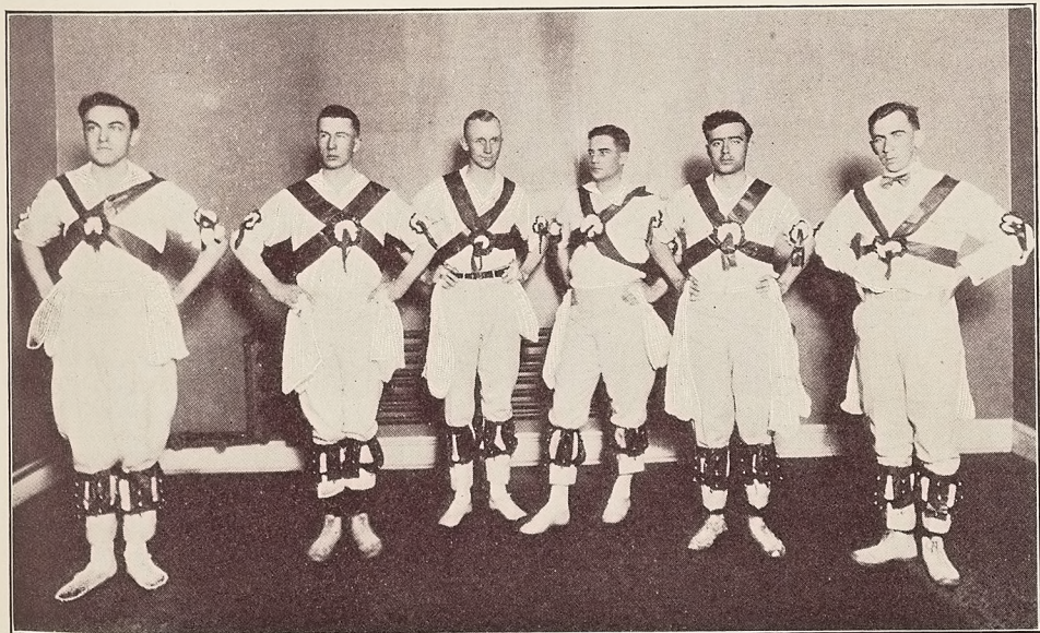
Morris Dancers in Shakespeare Pageant.