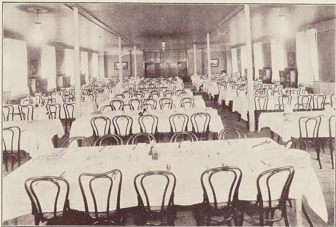
The Dining Room.