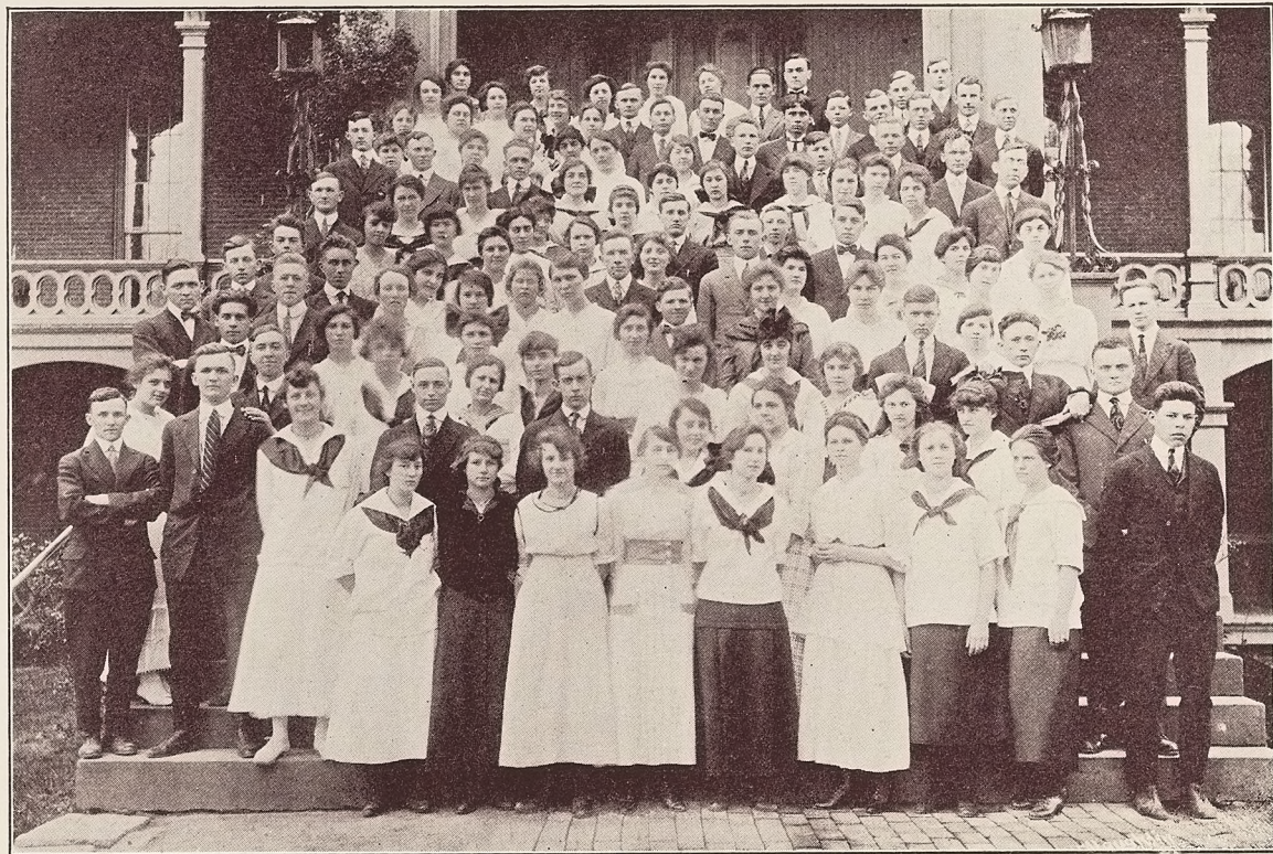
These Are from the Home County.