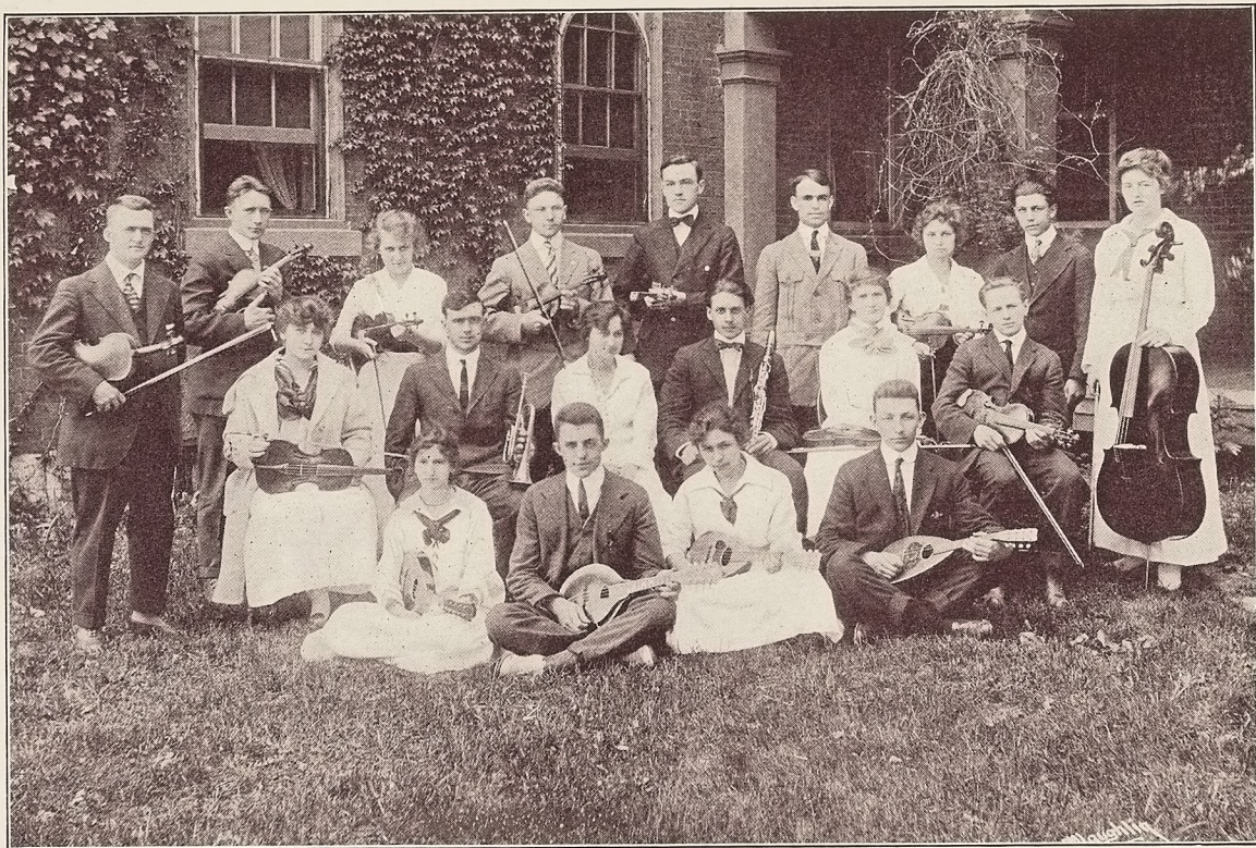
Normal School Orchestra.