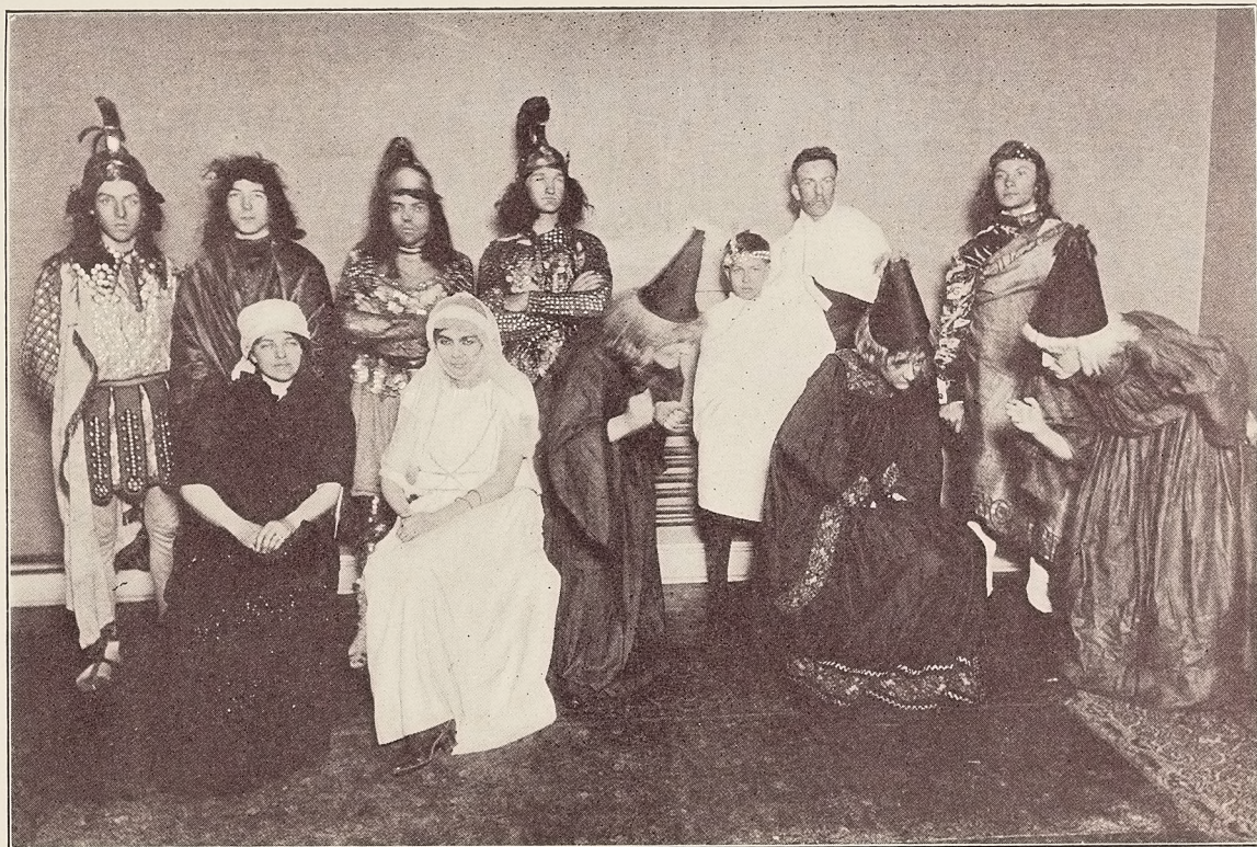
Cast of "Macbeth" in Shakespeare Pageant.