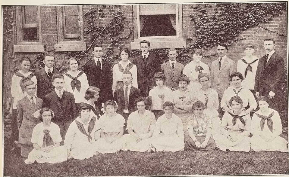
A Live Group from Little Fulton.