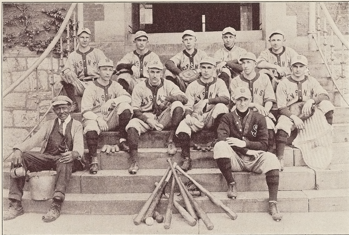
These Proved Their Prowess on the Base Ball Field.