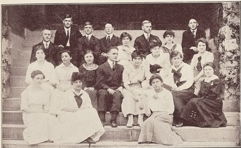
A Group of Perry Countians.