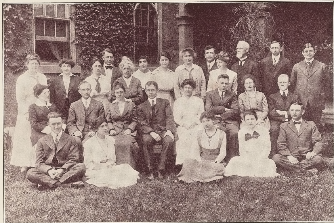
Faculty for 1915-1916.