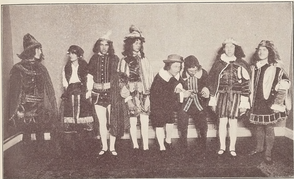
Characters from "The Merchant of Venice" in Shakespeare Pageant.