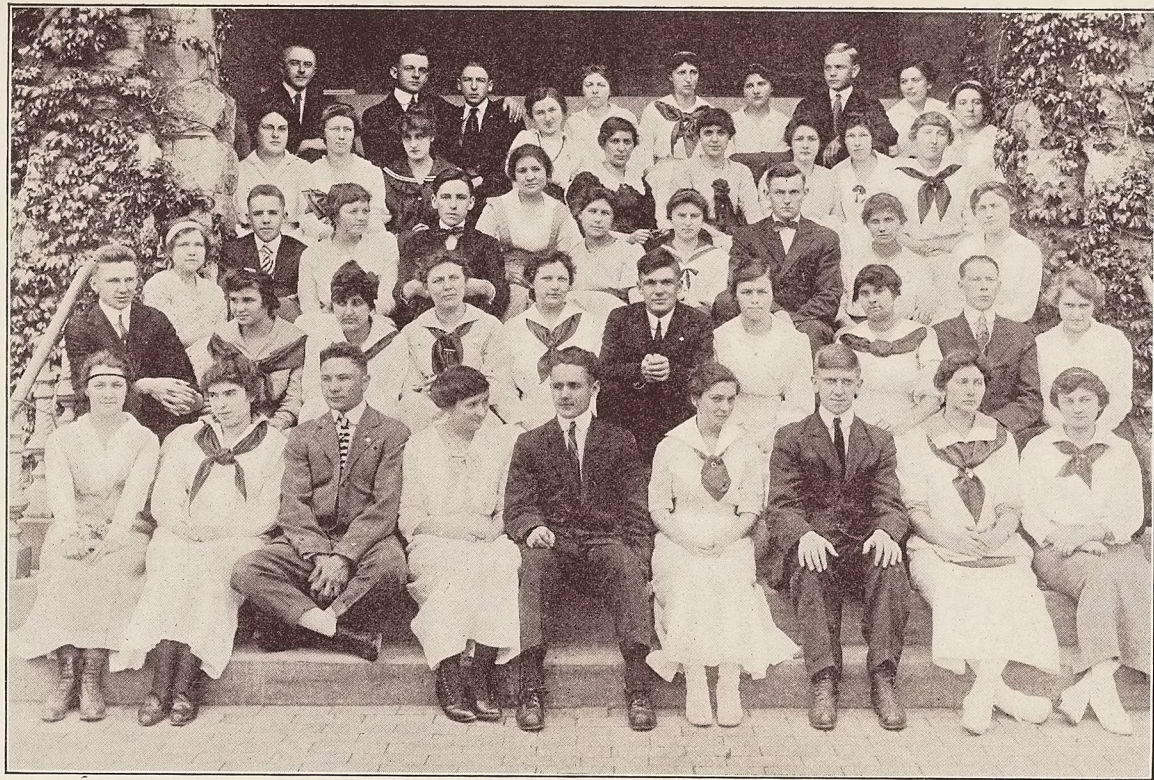
They Live Where the Blue Juniata Flows.