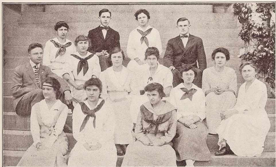
Juniata County Students.