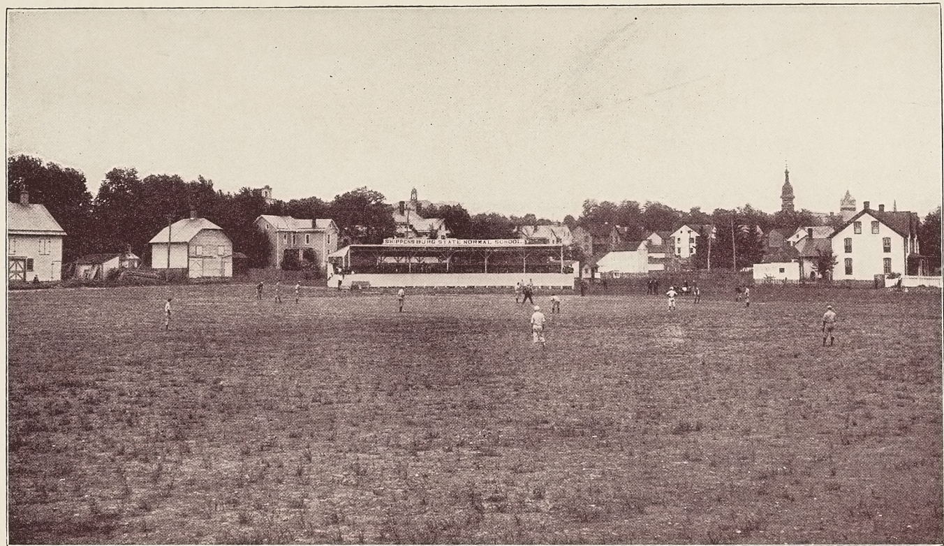
The Athletic Field.