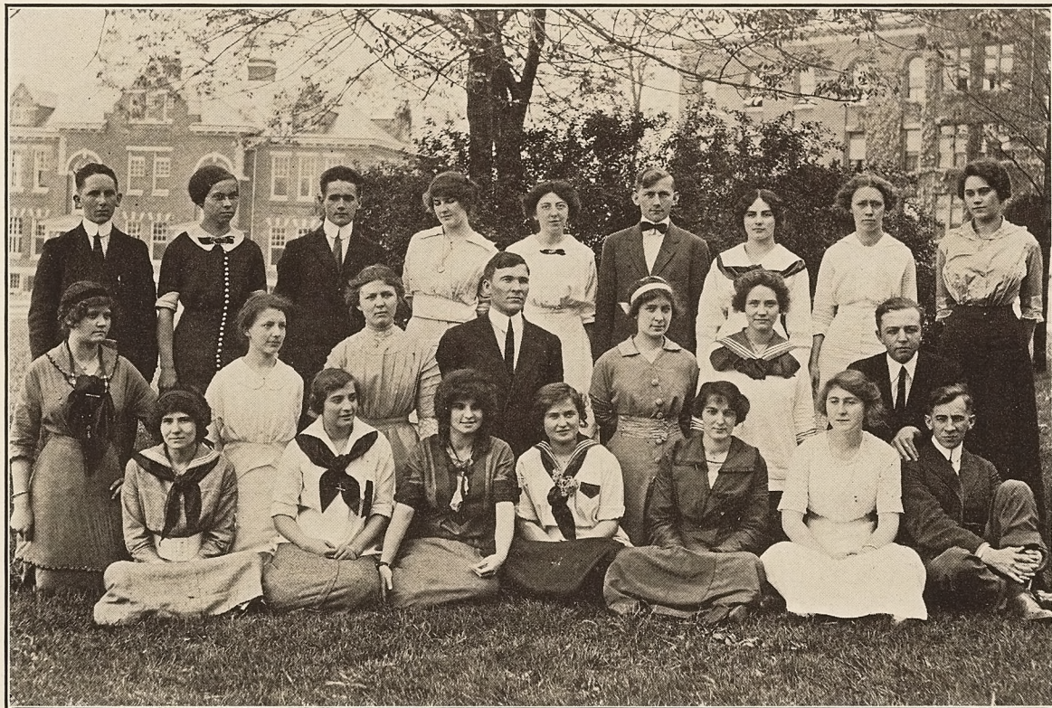
From "The Blue Juniata"