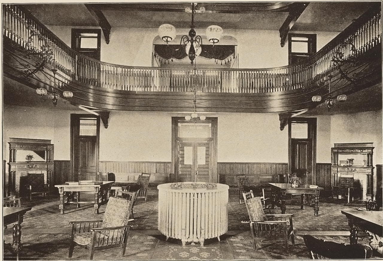
Interior of Girls' Dormitory