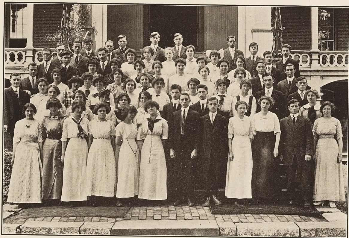
The Boys and Girls of Franklin