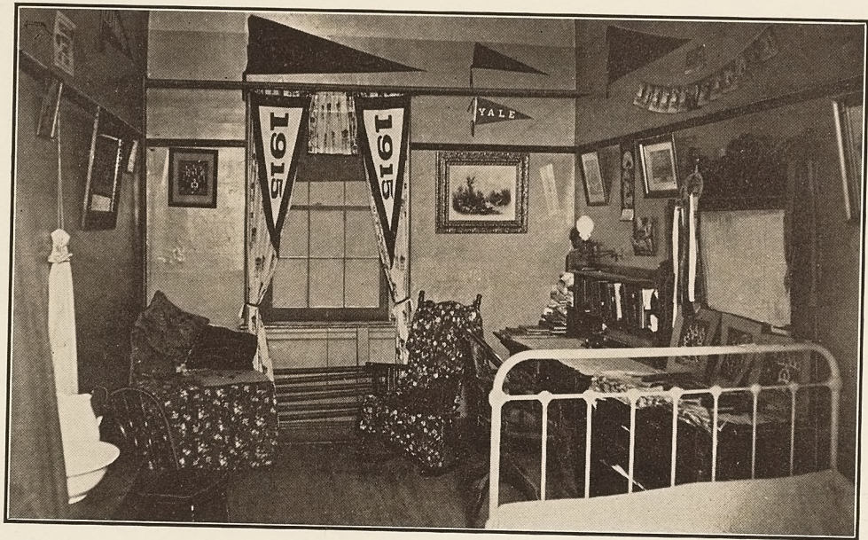
A Room in the Boys' Dormitory