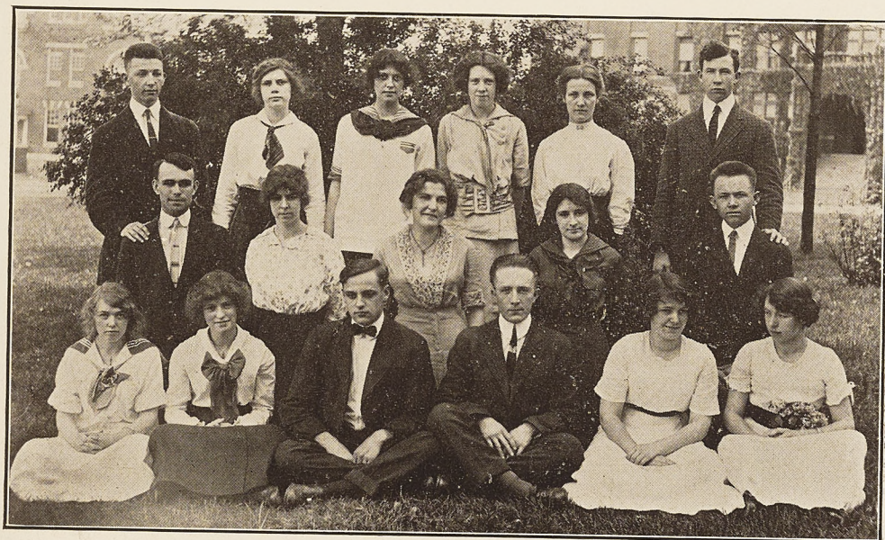
Fulton County's Representatives