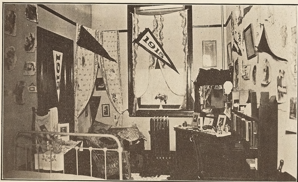
Room in Girls' Dormitory—First Floor