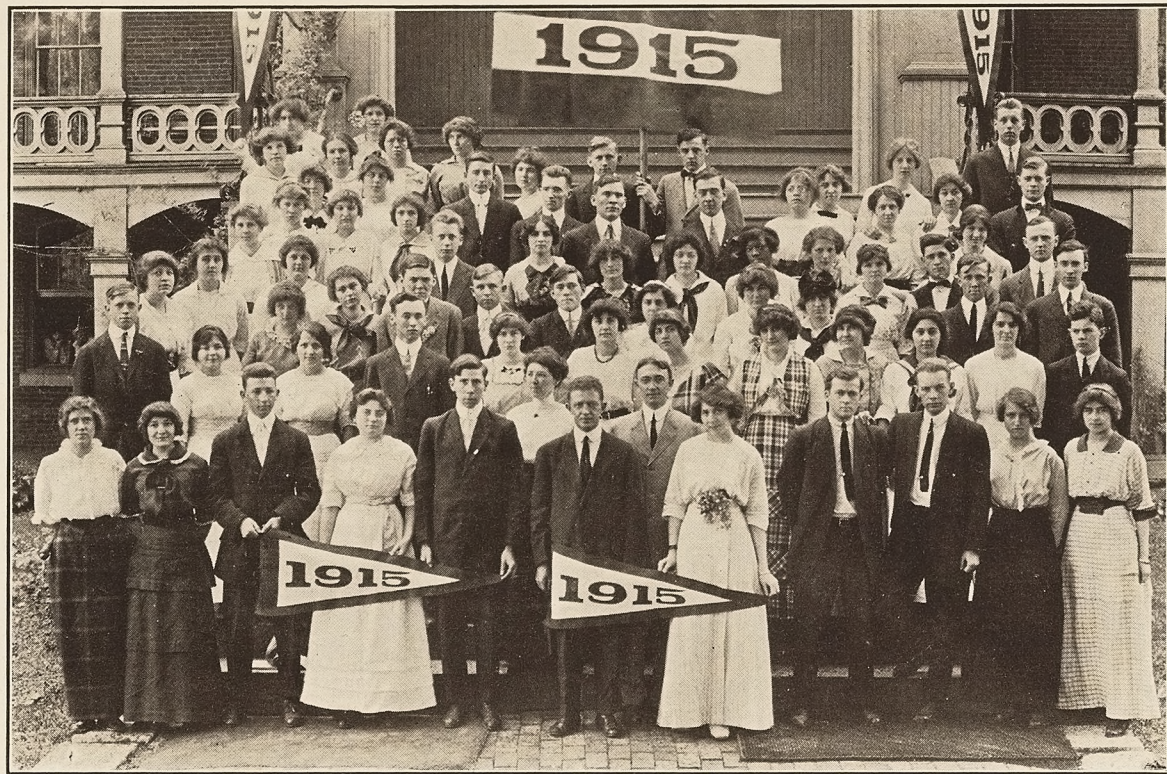
The Junior Class