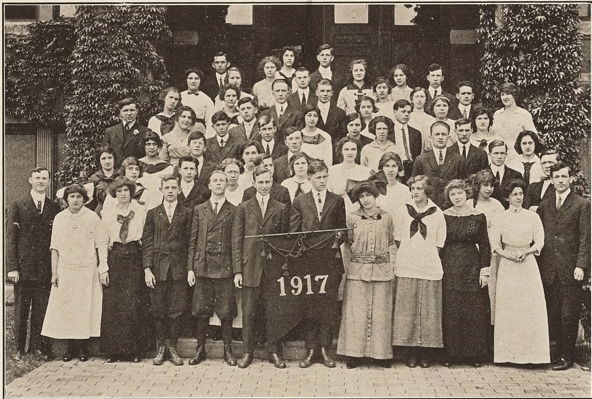
Freshman Class—First Division