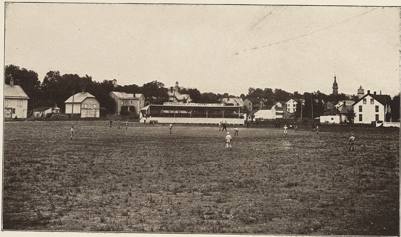
The Athletic Field