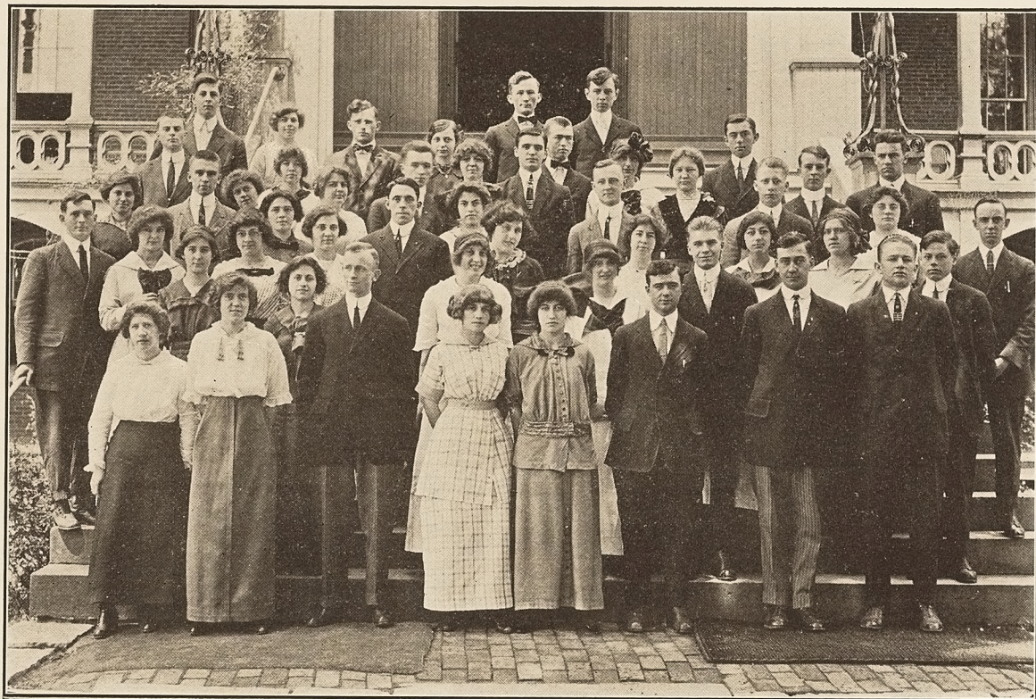
The Adams County Students