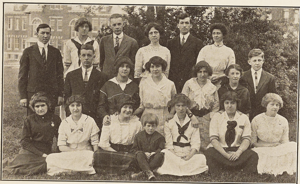
A Group of Dauphin Countians