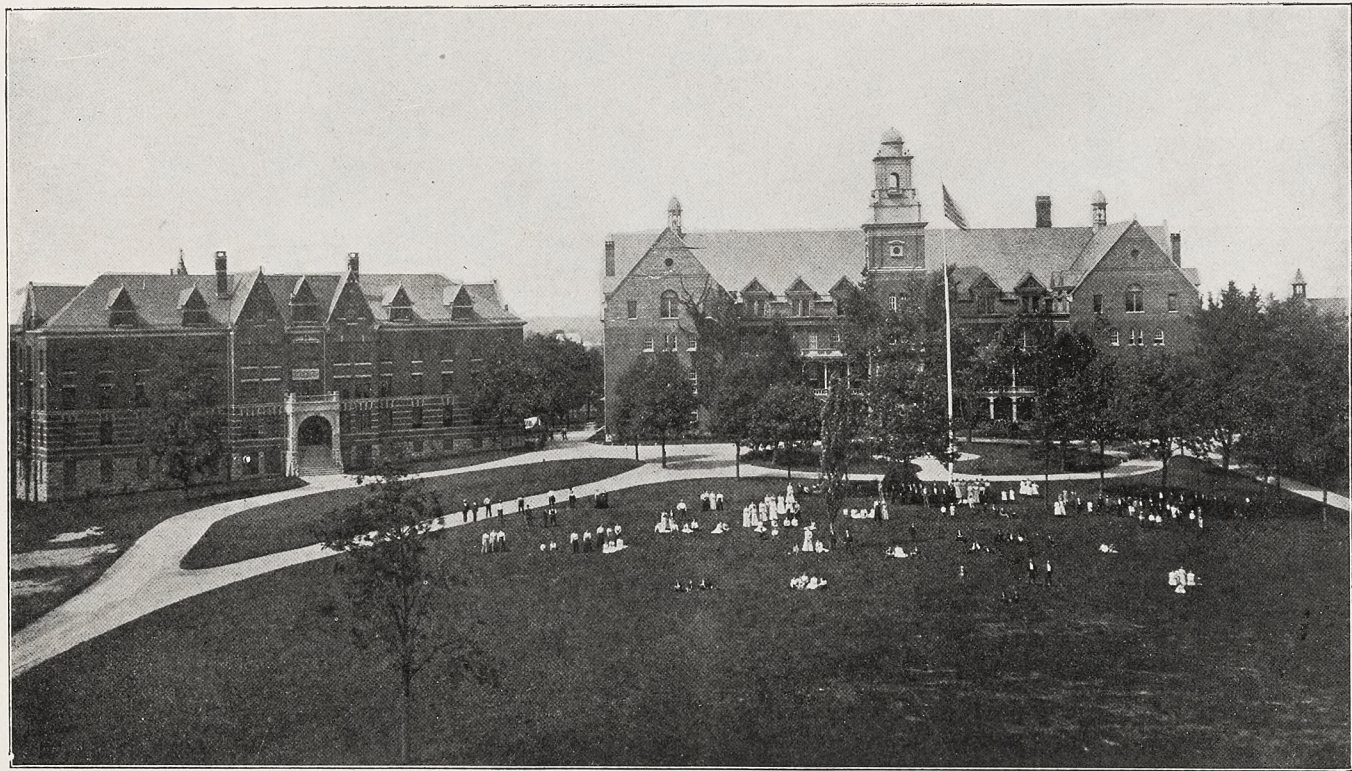
BUILDINGS AND GROUNDS