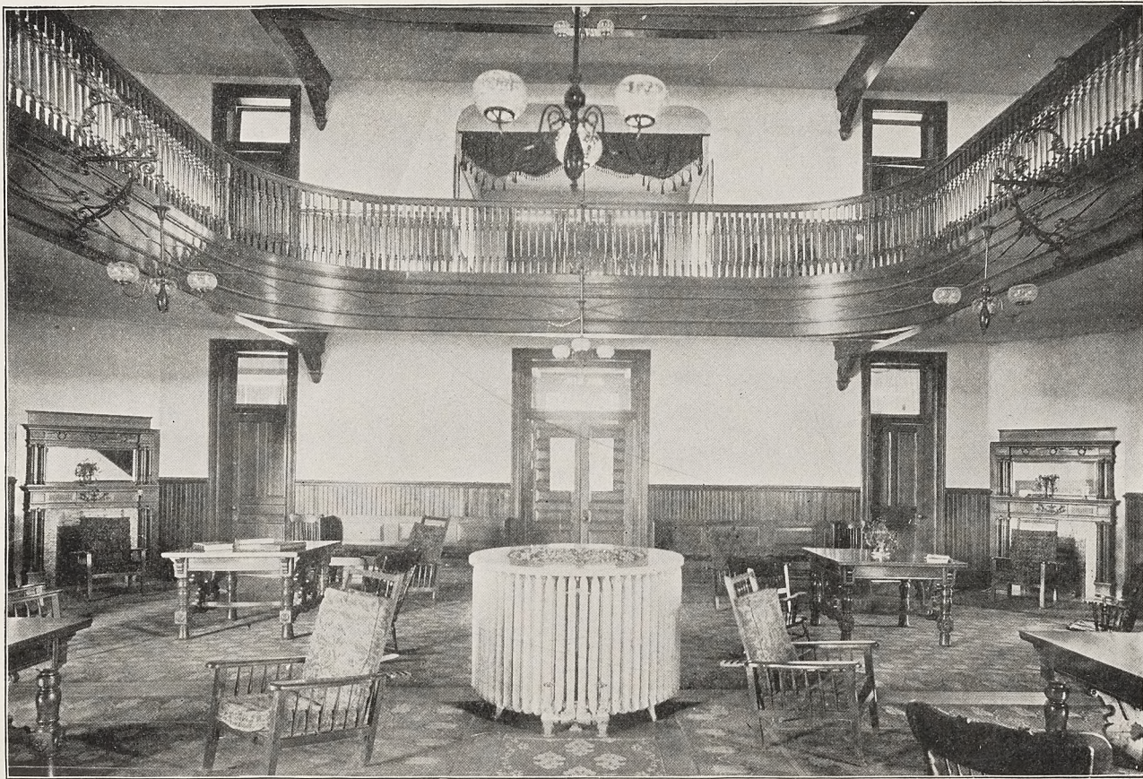
INTERIOR OF GIRLS' DORMITORY