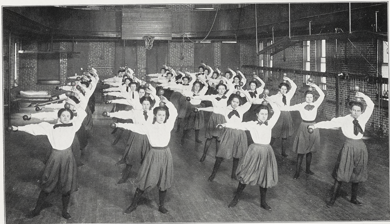
DUMB BELL EXERCISES