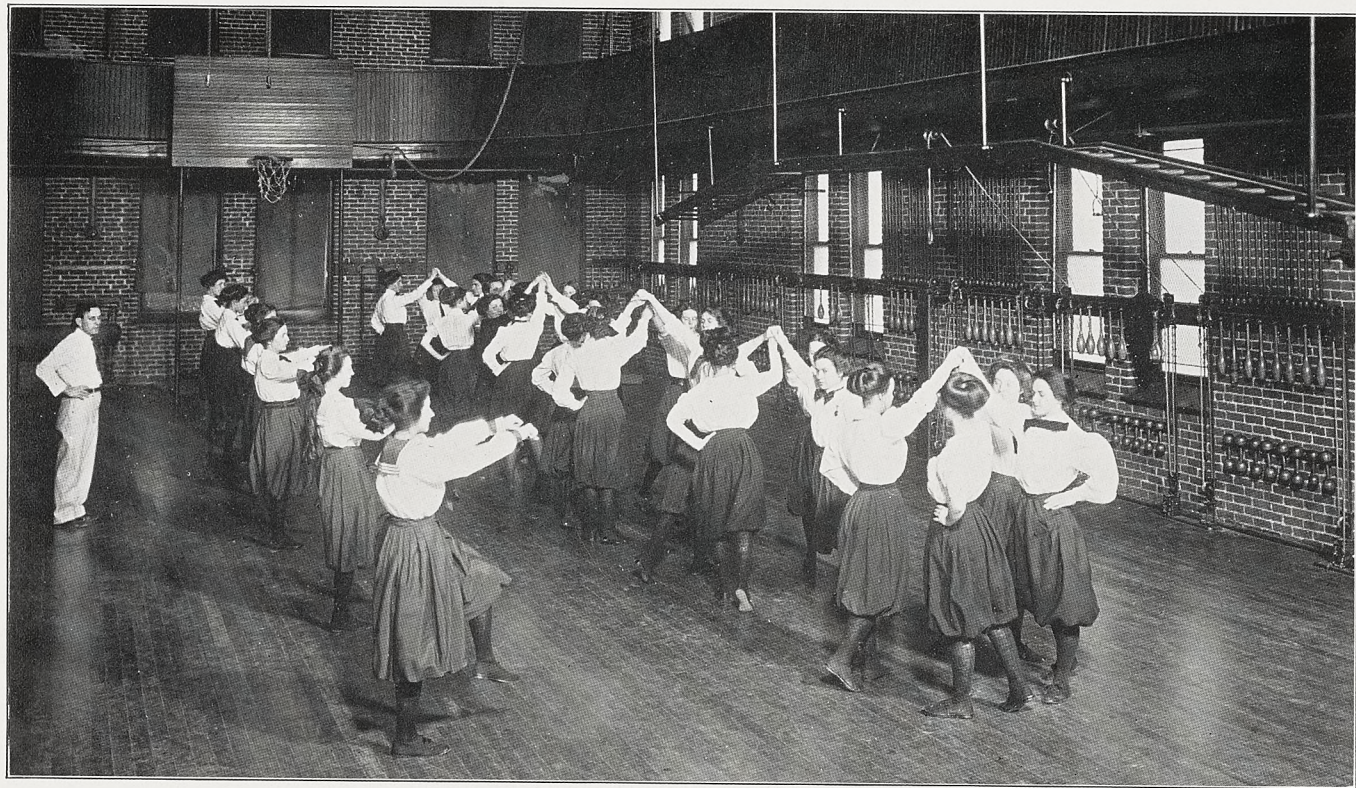
FOLK DANCE—THE SPINNING WHEEL