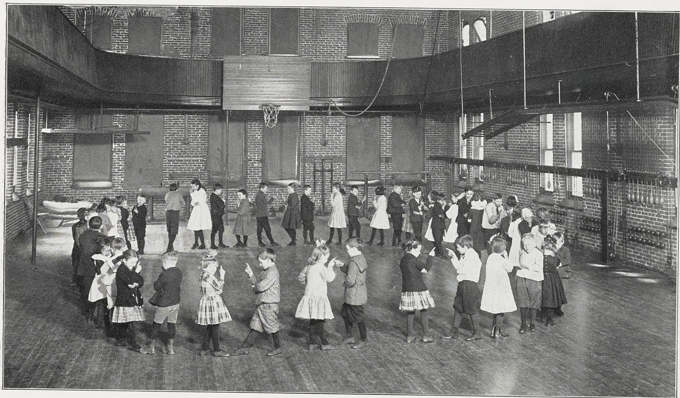
CHILDREN'S PLAYGROUND GYMNASTICS