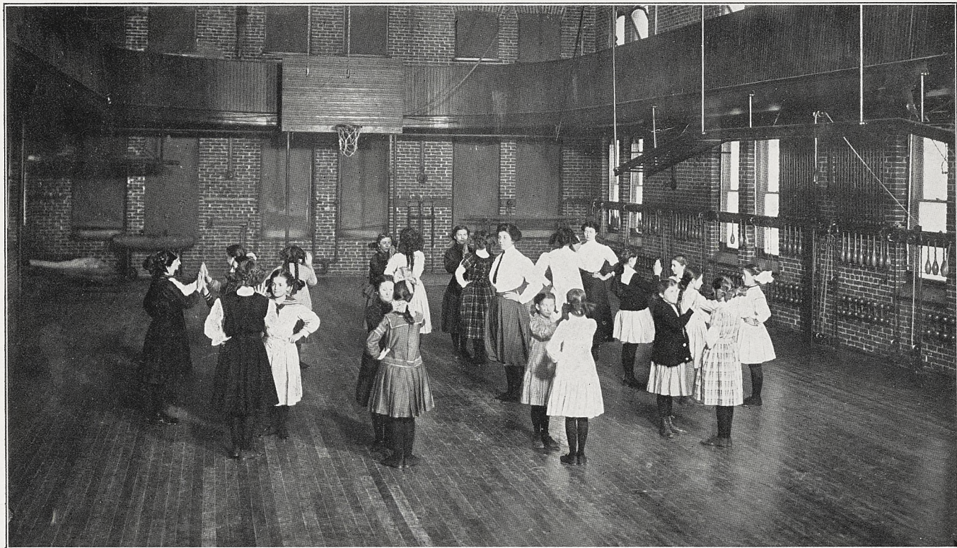
SWEDISH DANCE—MISS HARMON'S CLASS