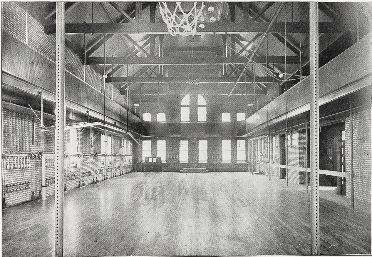
Interior of Gymnasium.