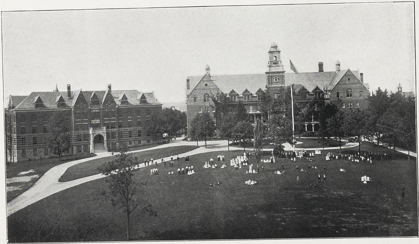
Campus and Students.