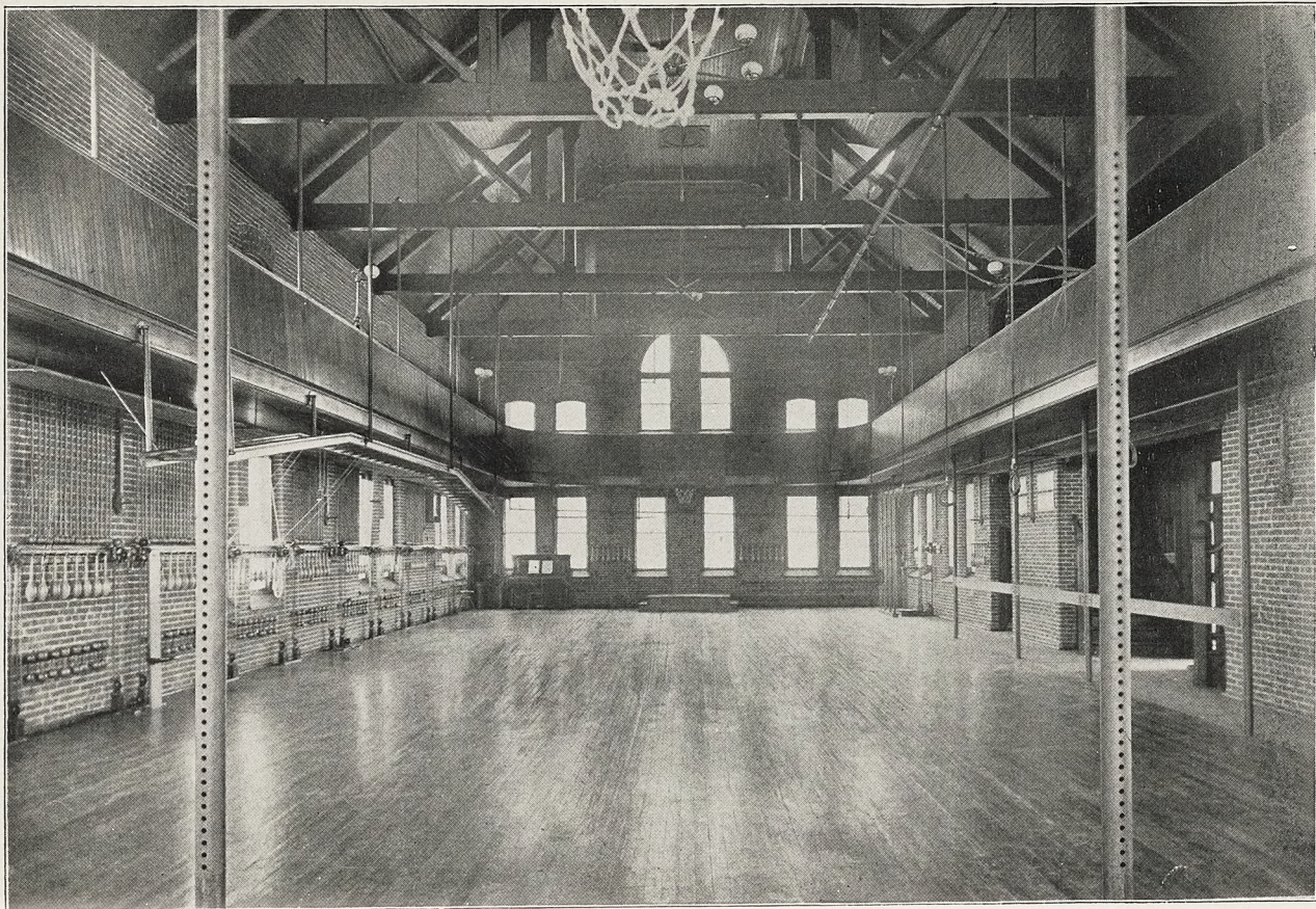
INTERIOR OF GYMNASIUM