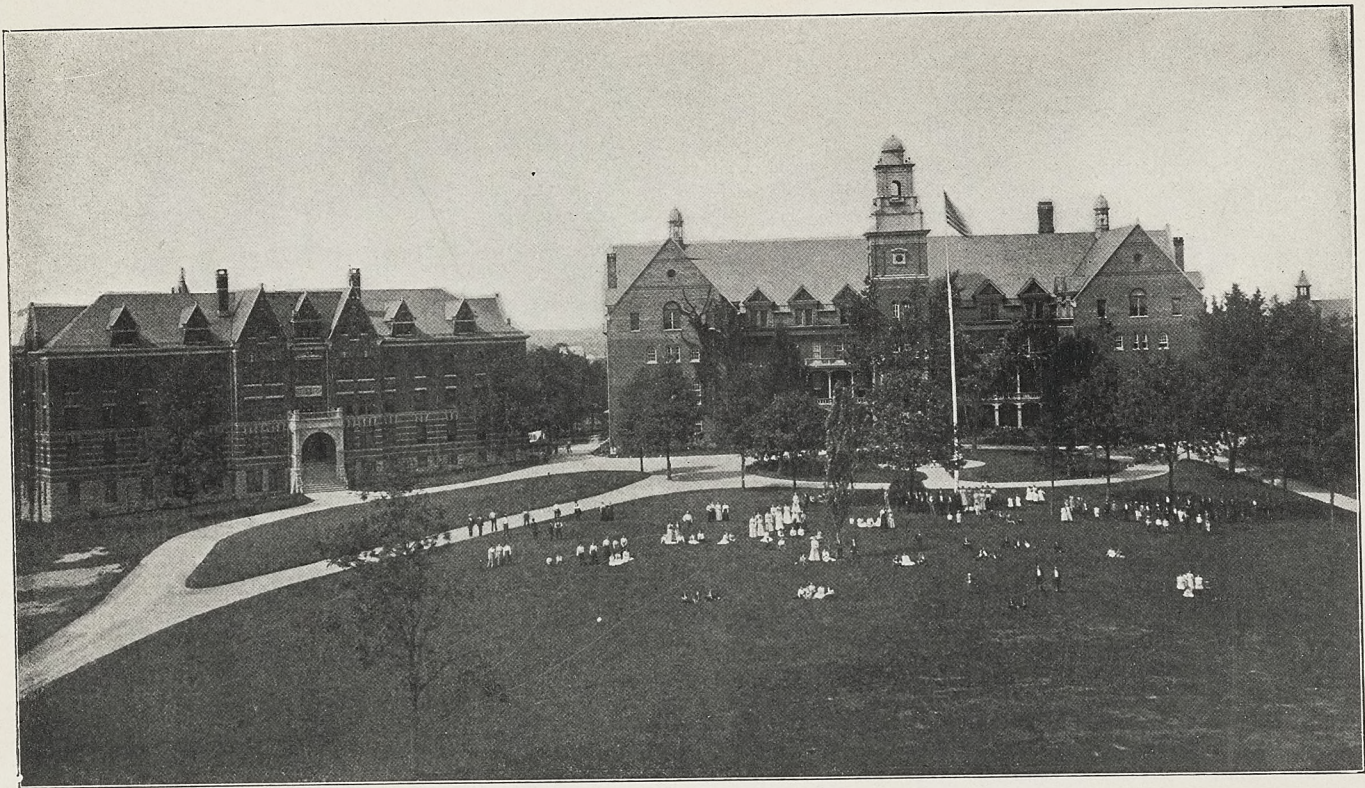
CAMPUS AND STUDENTS