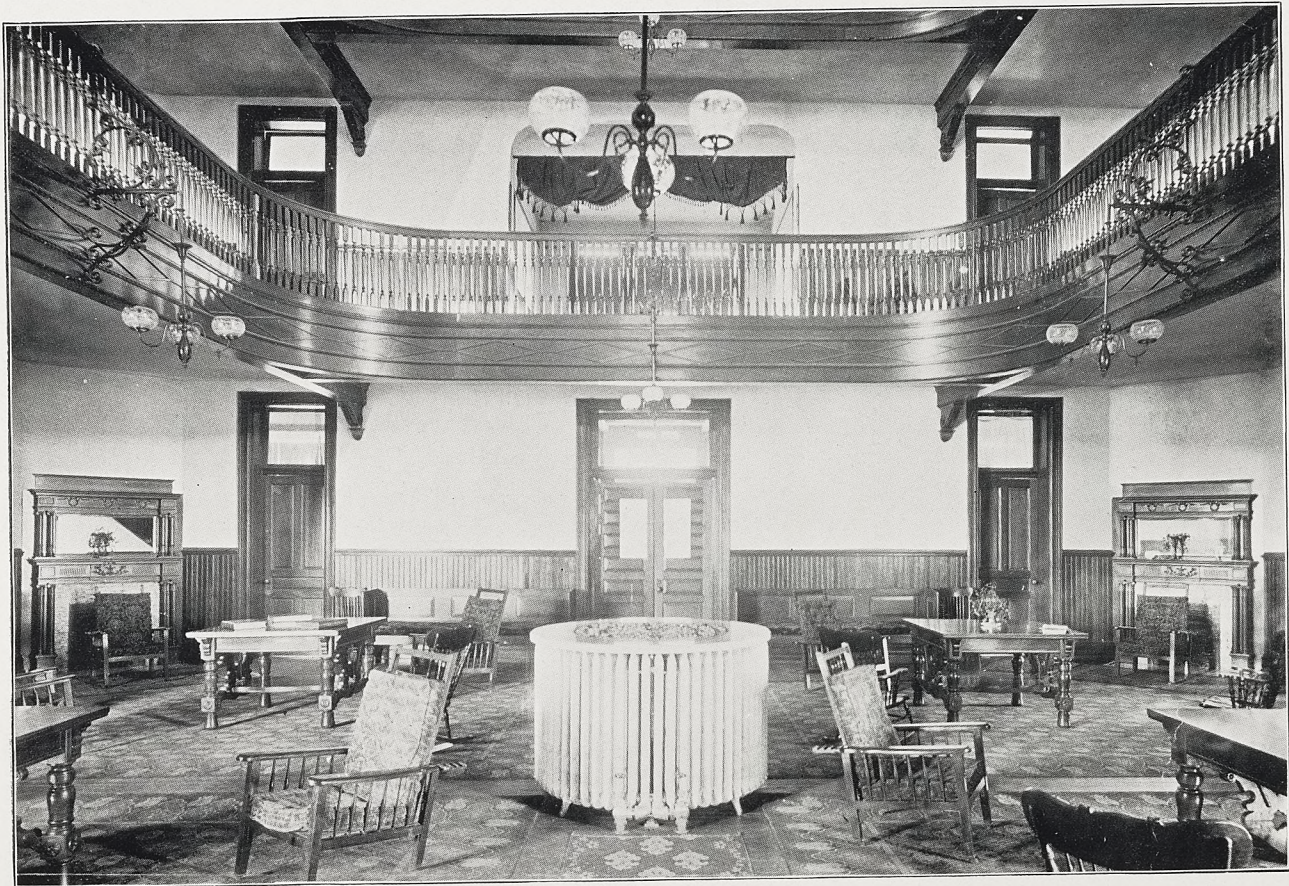
INTERIOR OF LADIES' DORMITORY