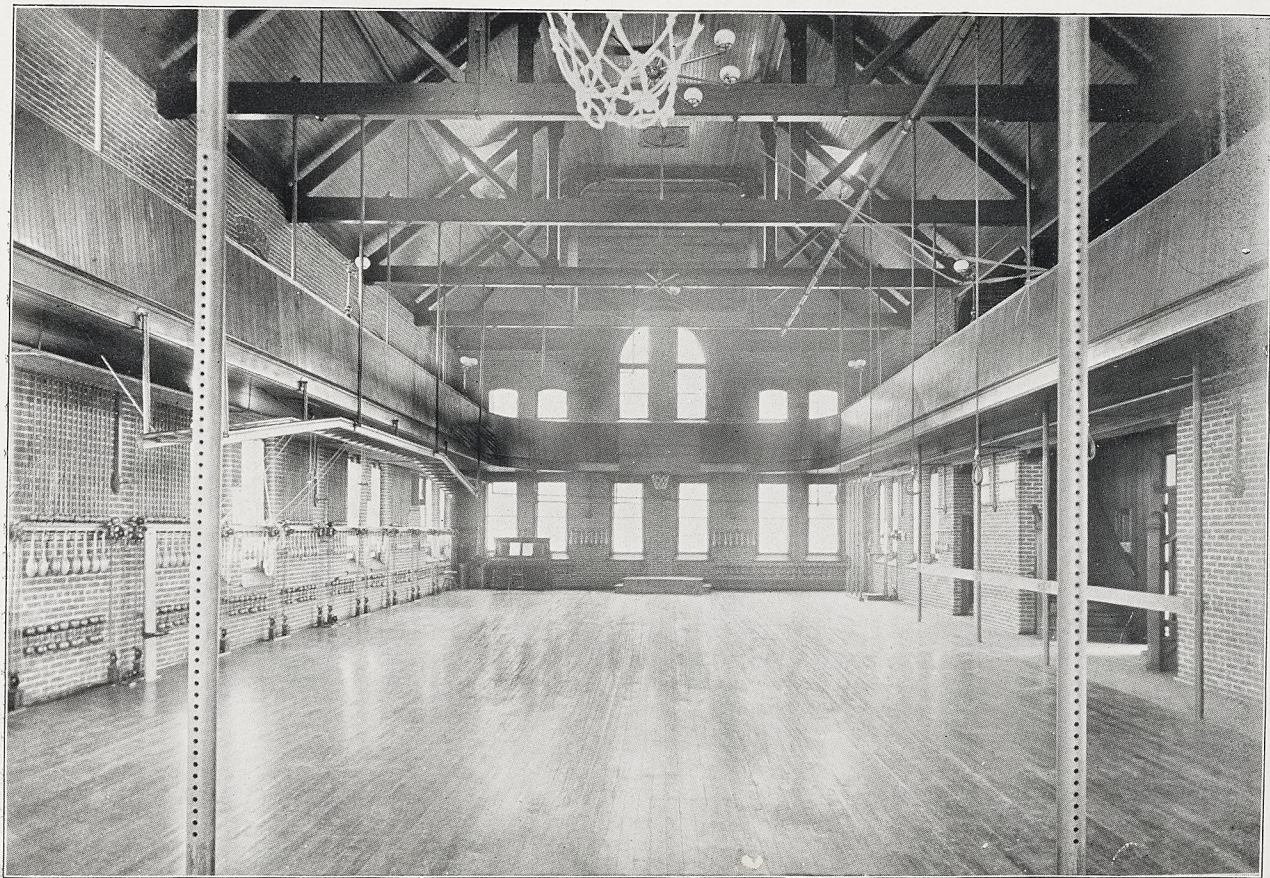
INTERIOR OF GYMNASIUM