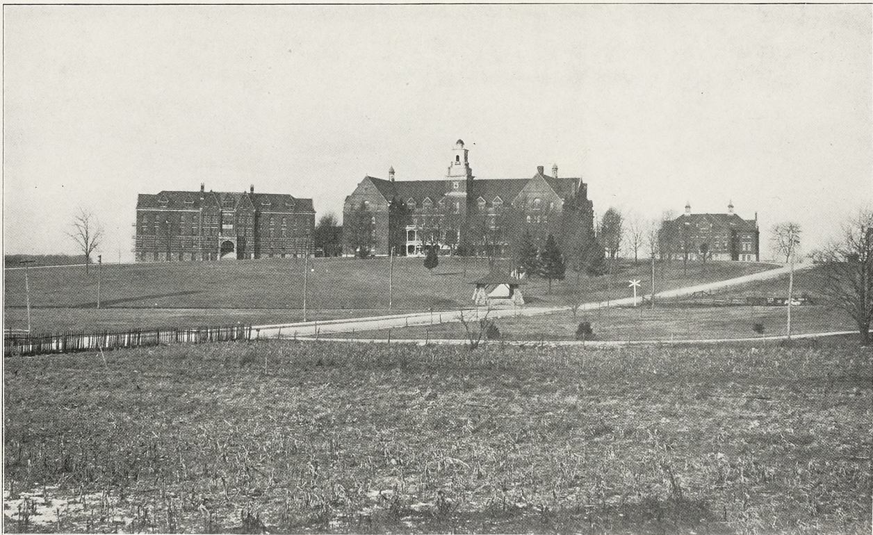
NORMAL BUILDINGS AND CAMPUS