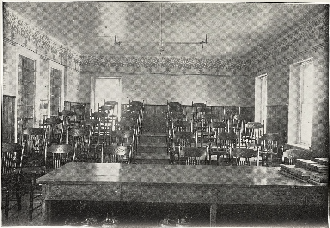
RECITATION ROOM IN PHYSICS