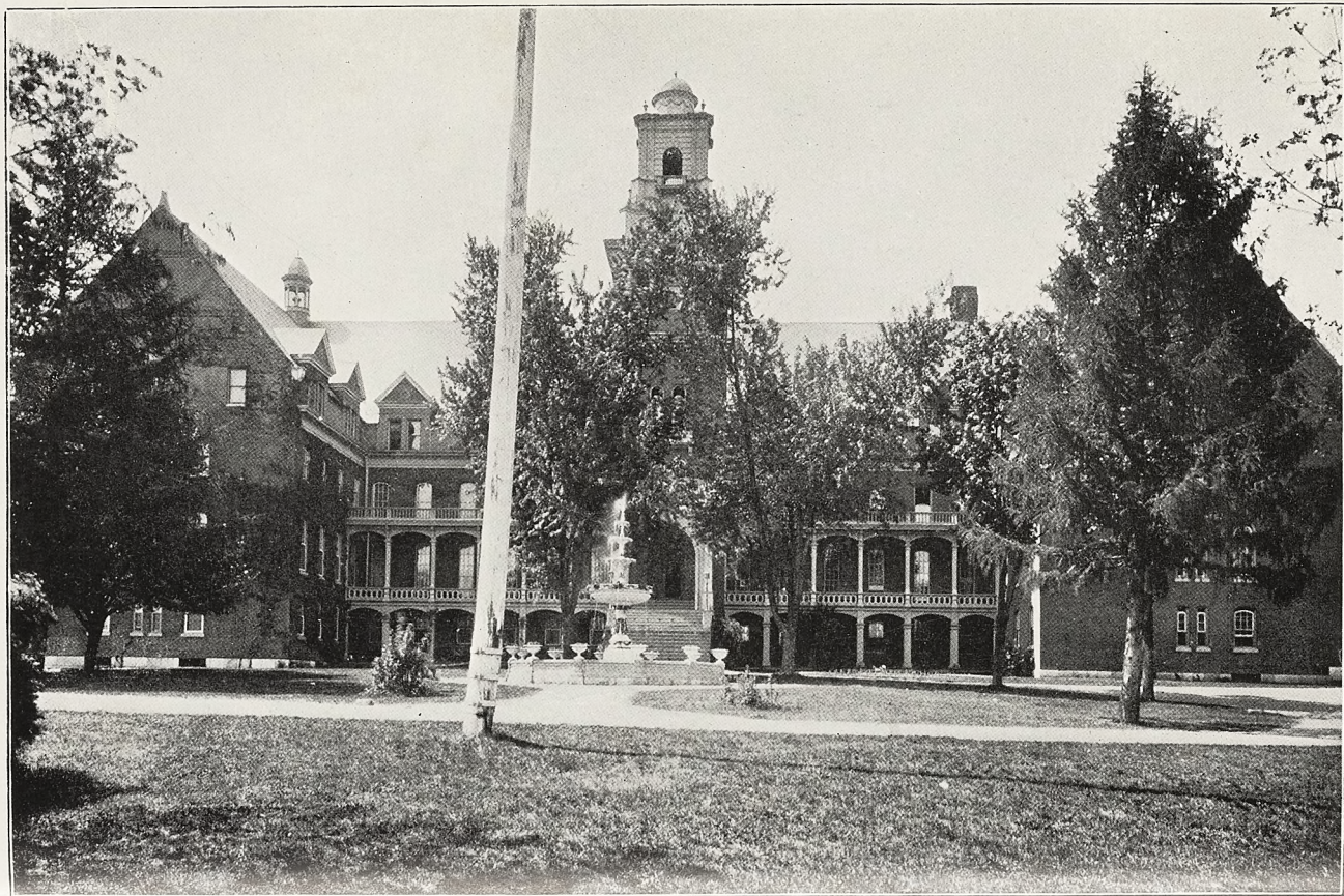
ADMINISTRATION BUILDING AND GENTLEMEN'S DORMITORY