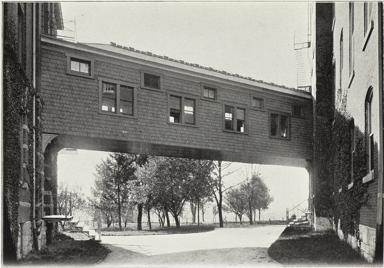
BRIDGE CONNECTING LADIES' DORMITORY WITH ADMINISTRATION BUILDING