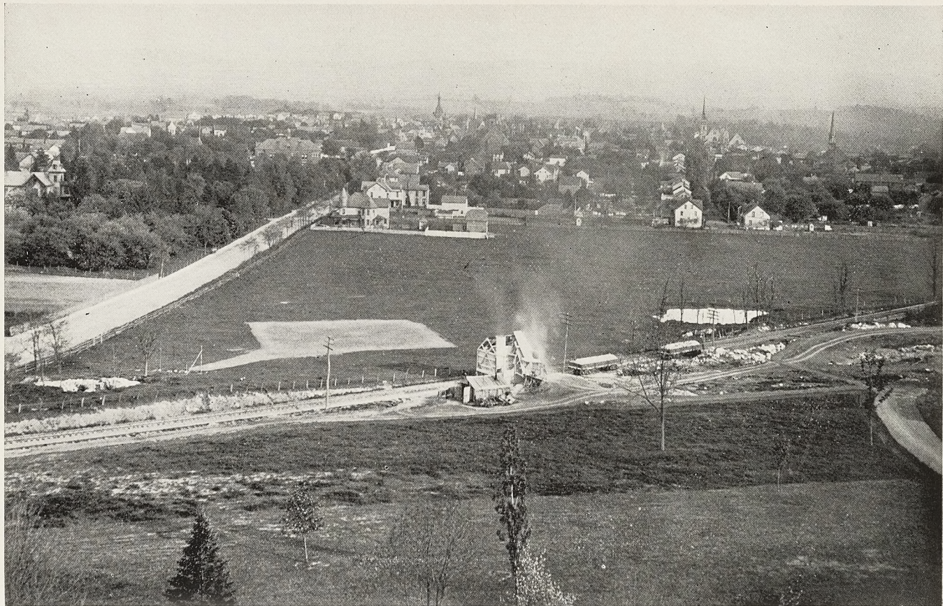
VIEW OF SHIPPENSBURG FROM NORMAL TOWER