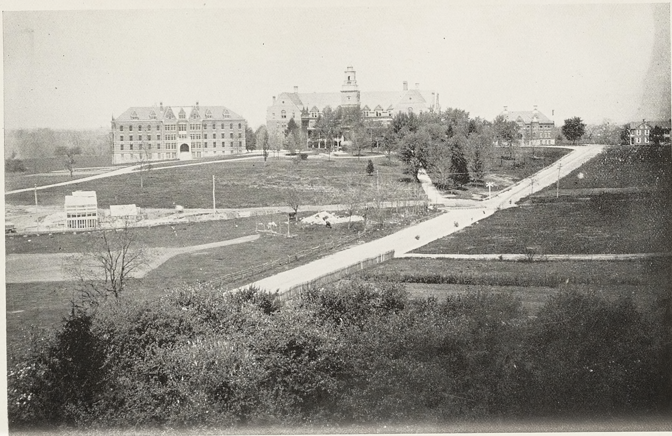
GROUP OF NORMAL BUILDINGS