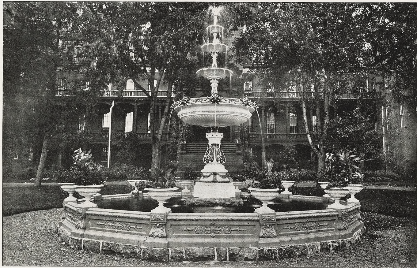
THE NEW FOUNTAIN DEDICATED BY THE CLASS OF '96.