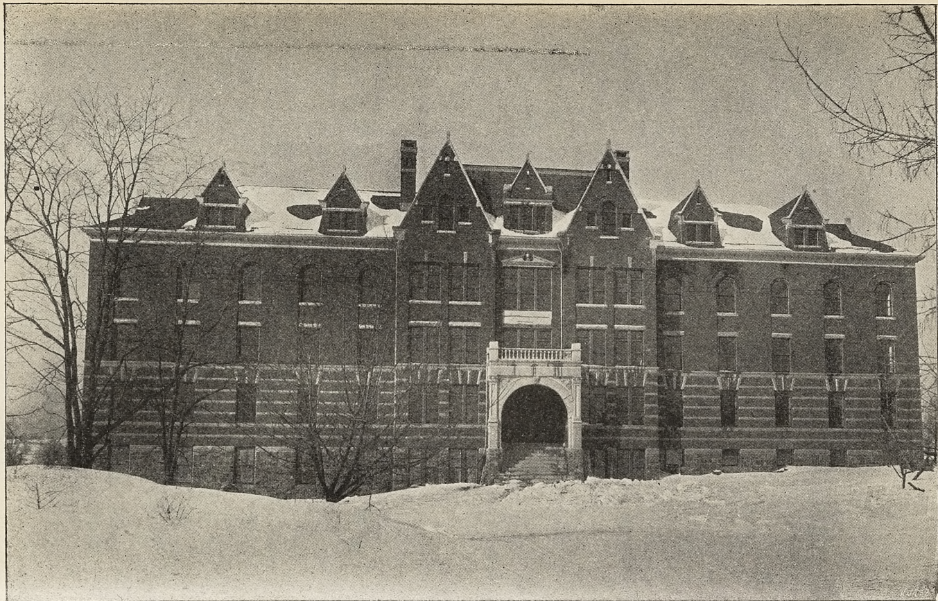
LADIES' NEW DORMITORY