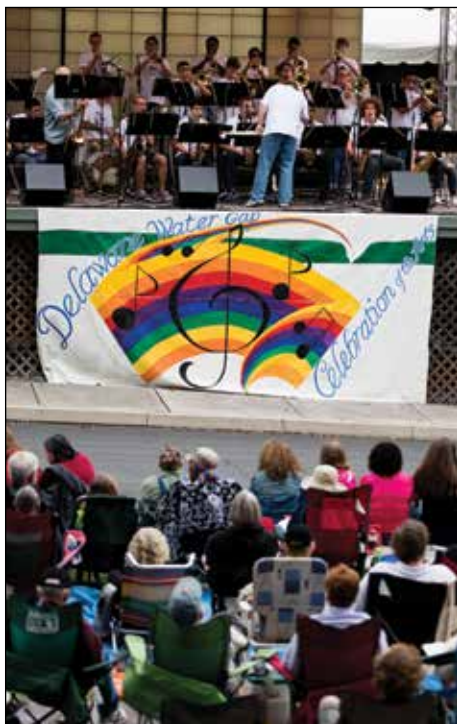
The 2015 COTA Cats