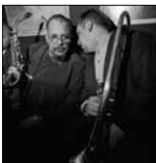
Cover Photo (front): Jackie McLean at the Village Vanguard, NYC.