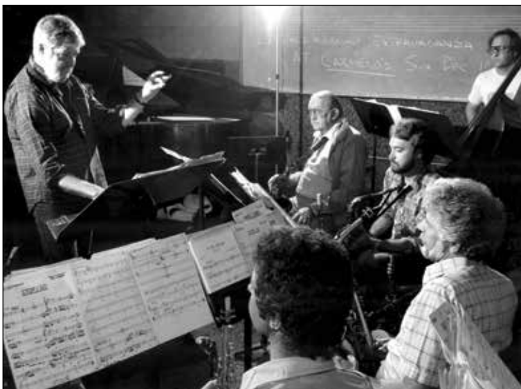
Bill Holman directing at the Musicians Union rehearsal hall, Los Angeles circa 1970s.

In 2000 I did a project with the WDR Big Band that we called "Jazz Masterpieces Revisited." My idea was to take jazz compositions that had originally been recorded by small groups and reorchestrate them for big band. As soon as this idea came to me I knew that a big band orchestration of Jazz in D Minor had to be the grand finale. The title was changed to Jazz in G Minor, because the melodic content worked