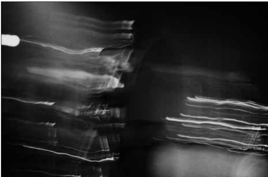
John Coltrane, 1961-1962.