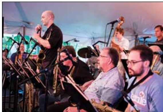
COTA Festival Orchestra