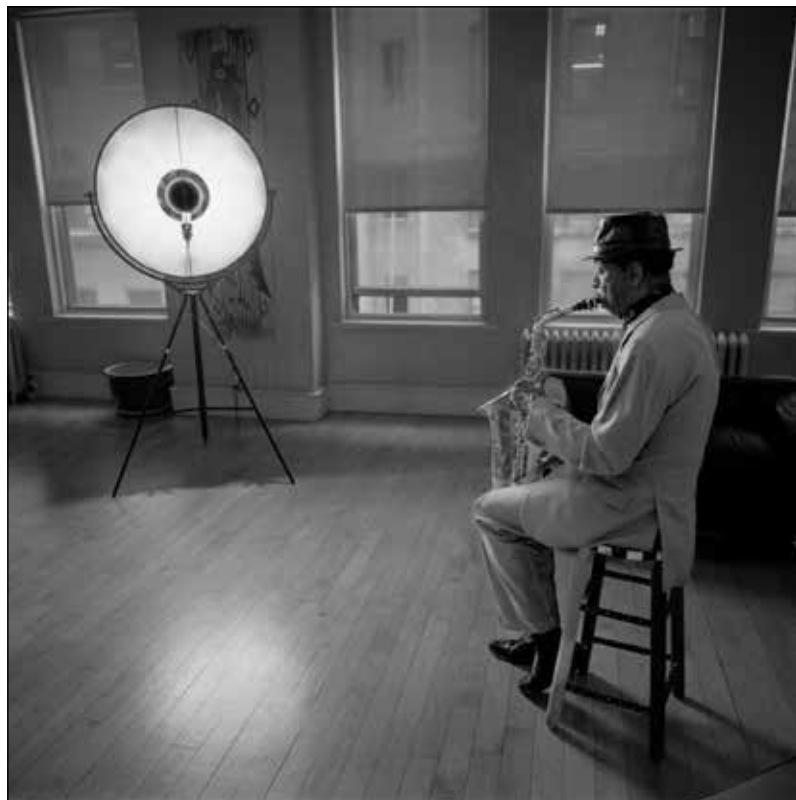
Ornette Coleman, 2007