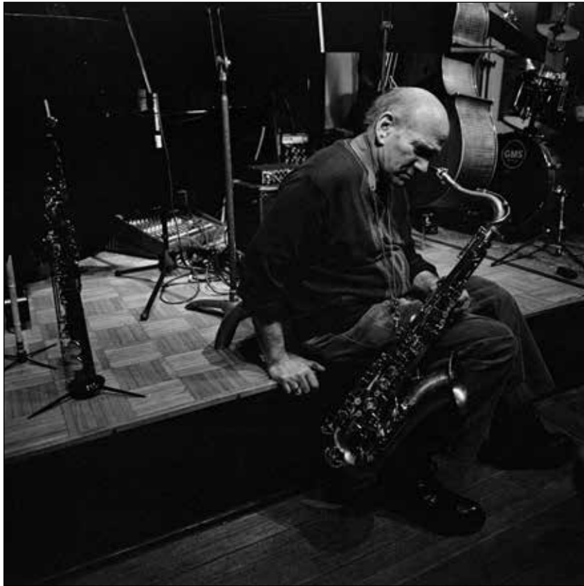
Dave Liebman at the Deer Head Inn, 2010