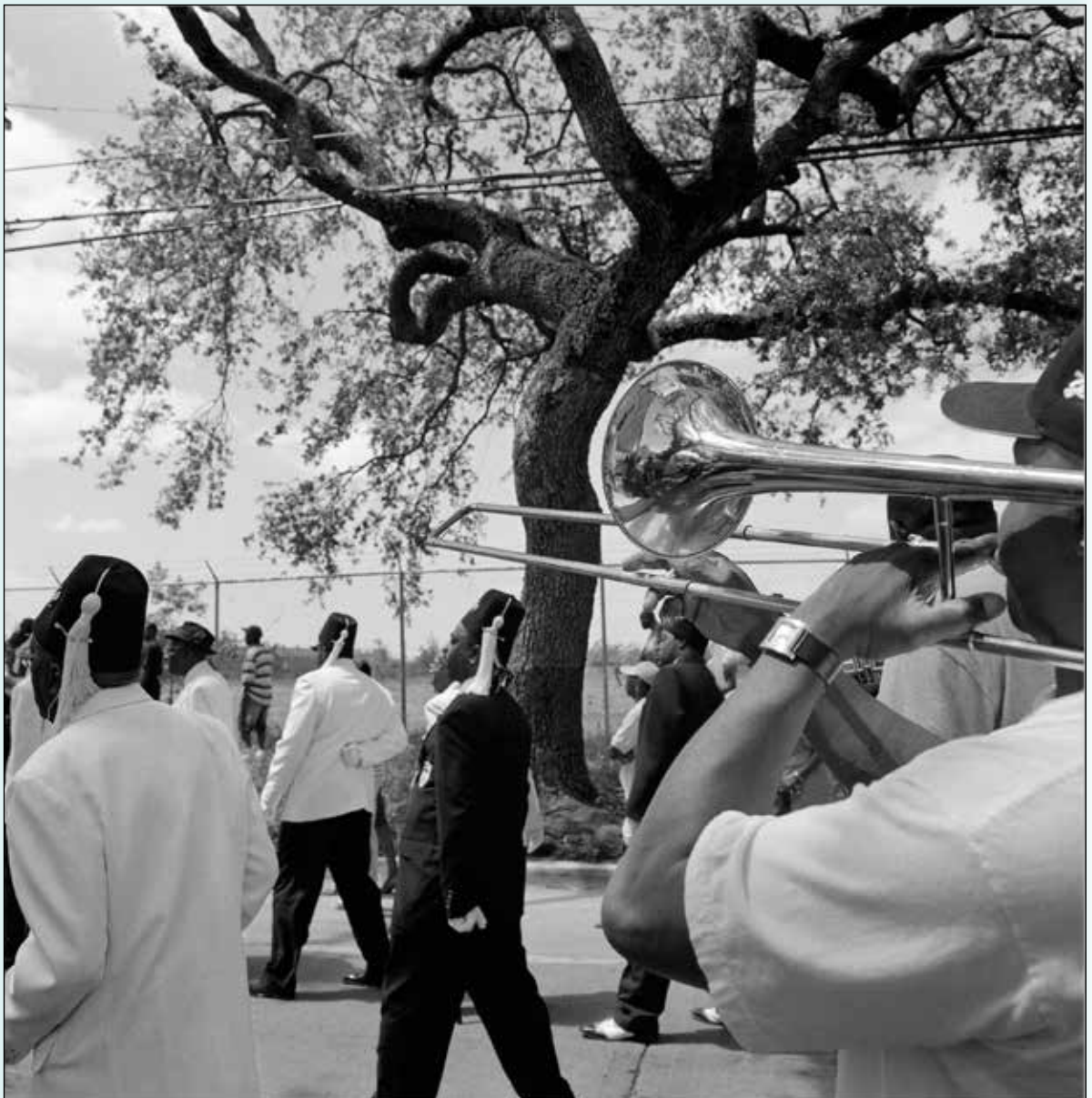
The Dancing Tree, 2006.