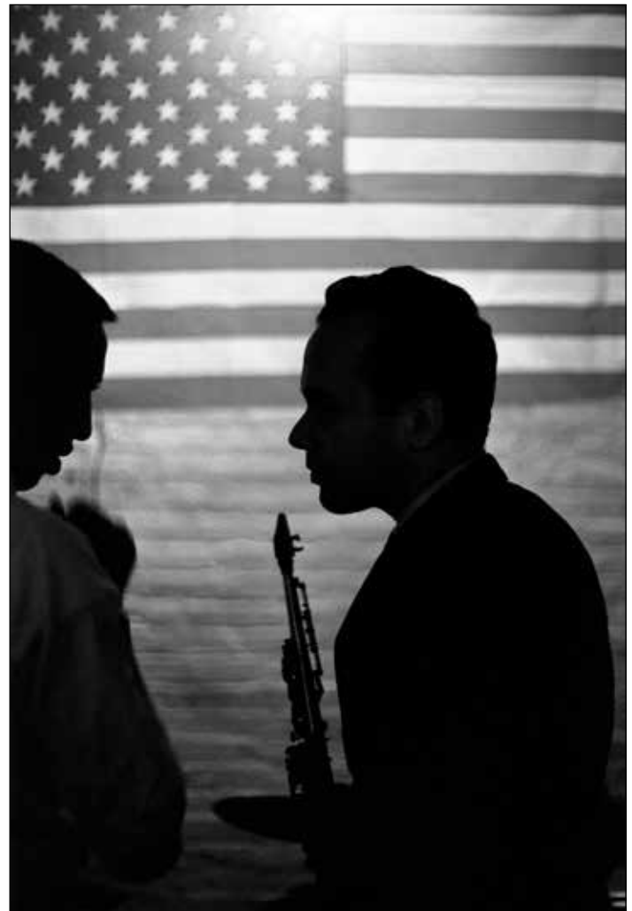
Steve Lacy, 1964.