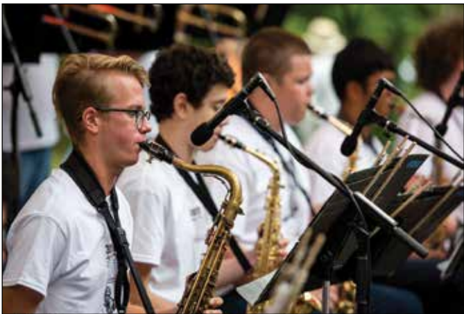
COTA Cat Saxophone section