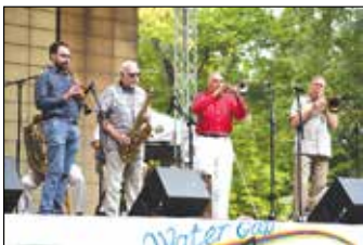
Center Spread: The Dixie Gents at the 2015 COTA Festival.