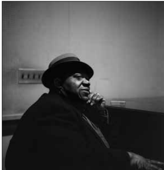
Jimmy Rushing, 1957.