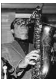
Cover Photo (back): Al Cohn, from the ACMJC photo archives.