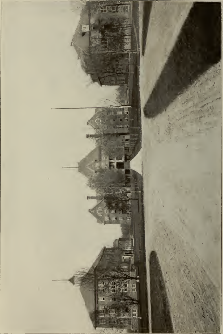
STATE NORMAL SCHOOL, EAST STROUDSBURG, PA.