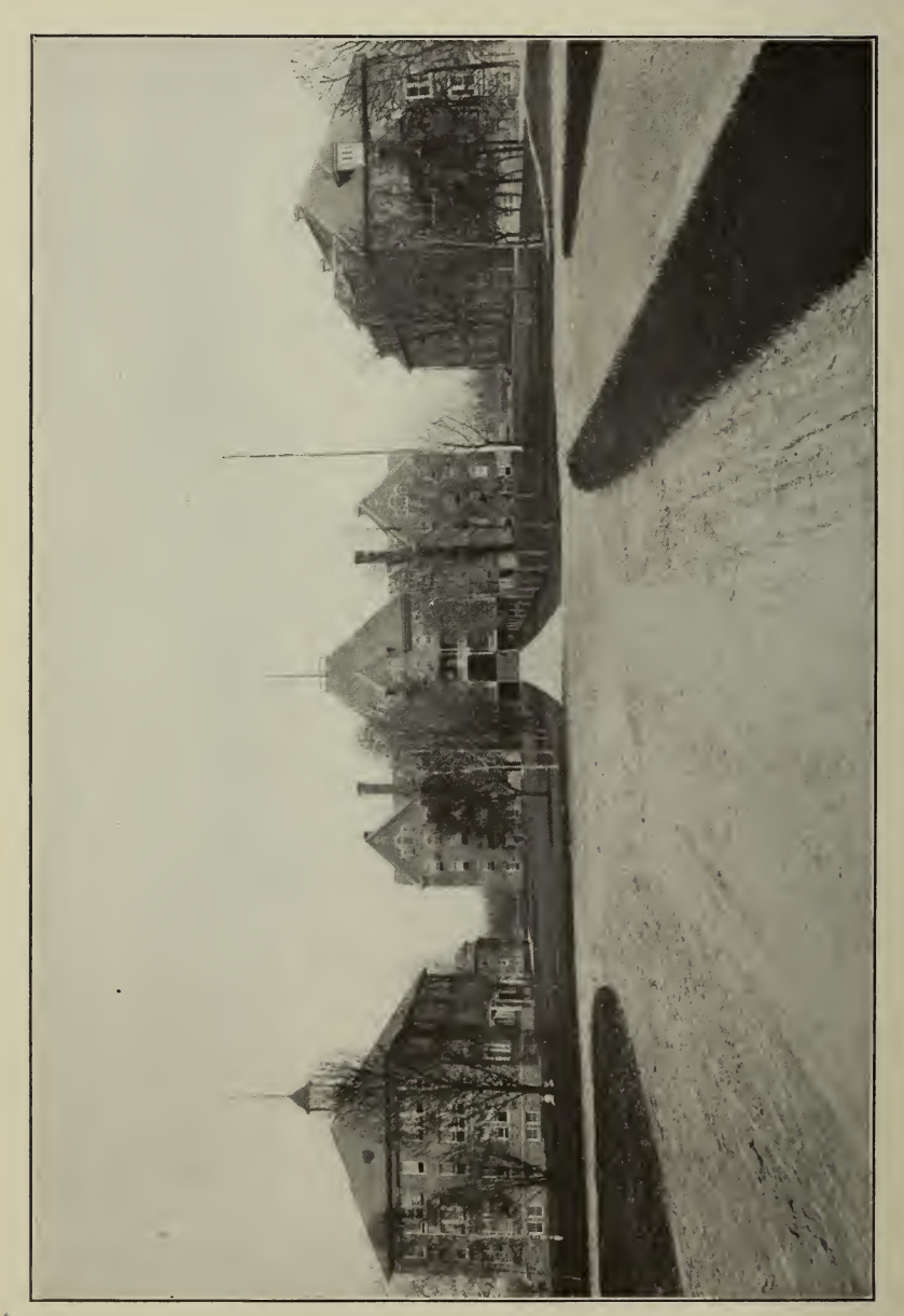
STATE NORMAL SCHOOL, EAST STROUDSBURG, PA.