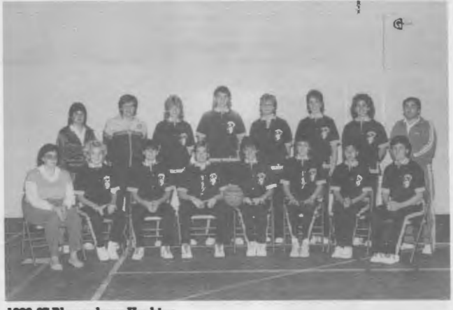
1986-87 Bloomsburg Huskies