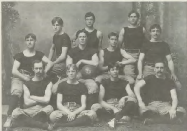
Bloomsburg's First Varsity Team—1894-95

The picture below shows the 1894-95 Bloomsburg Normal School basketball team. This was the school's first varsity basketball team.