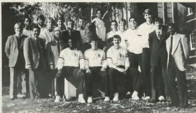
THE NEWEST EDITION OF THE HUSKIES!