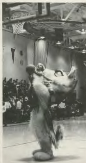
LOTS OF FUN!