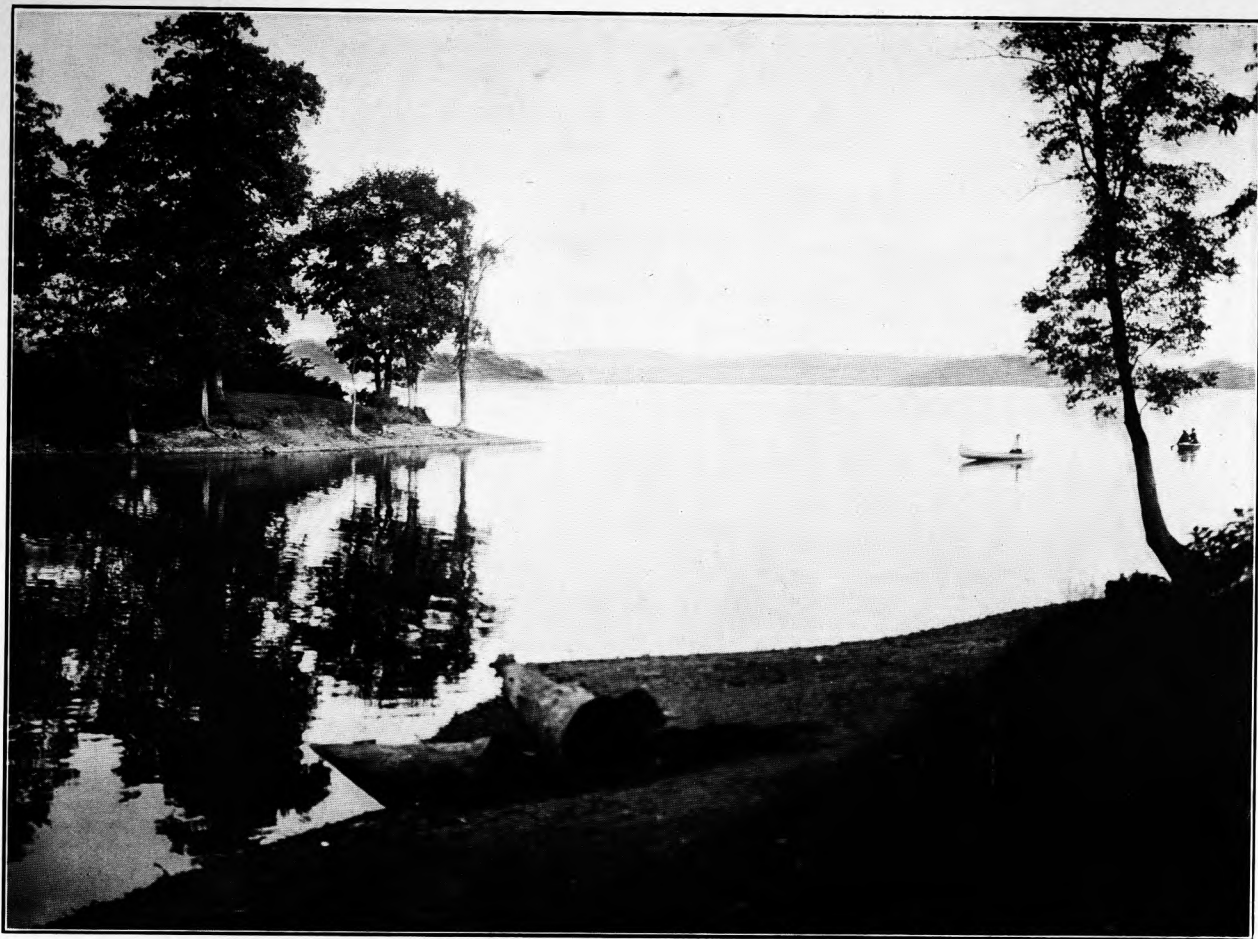
WHERE EVENING SHADOWS LINGER