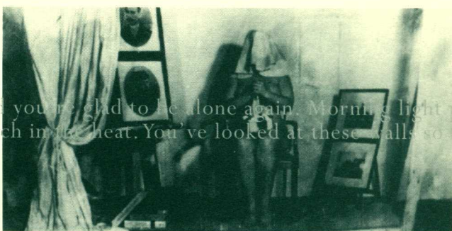
POWER, 1993, 4' x 8', EMULSION ON PAINTED WOOD.

The door clangs shut and you're glad to be alone again. Morning light pours in through a window far above your head, slightly sticky to the touch in the heat. You've looked at these walls so many times, you've memorized every crease and