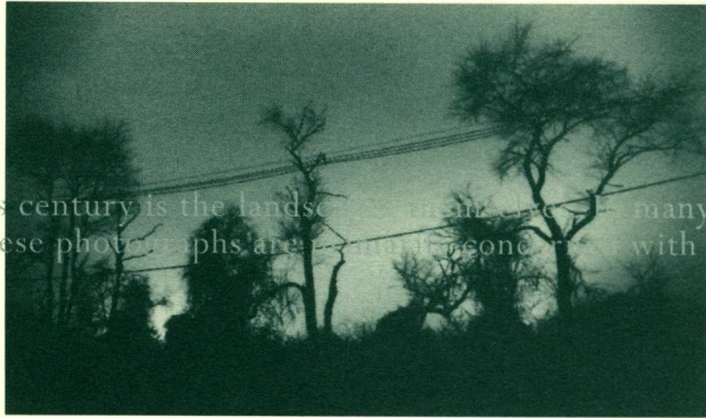
MERCER COUNTY, NJ, 1994, 11" x 14", COLOR PRINT.

What has changed in this century is the landscape within and around it. These photographs are taken in many regions of America, it is no longer possible to deal with the tension that occurs when the natural and