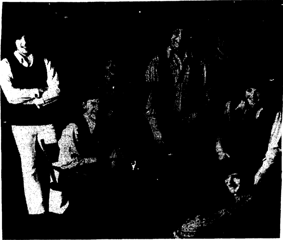
Big Name Entertainment presents the Ides of March for the Homecoming Concert.