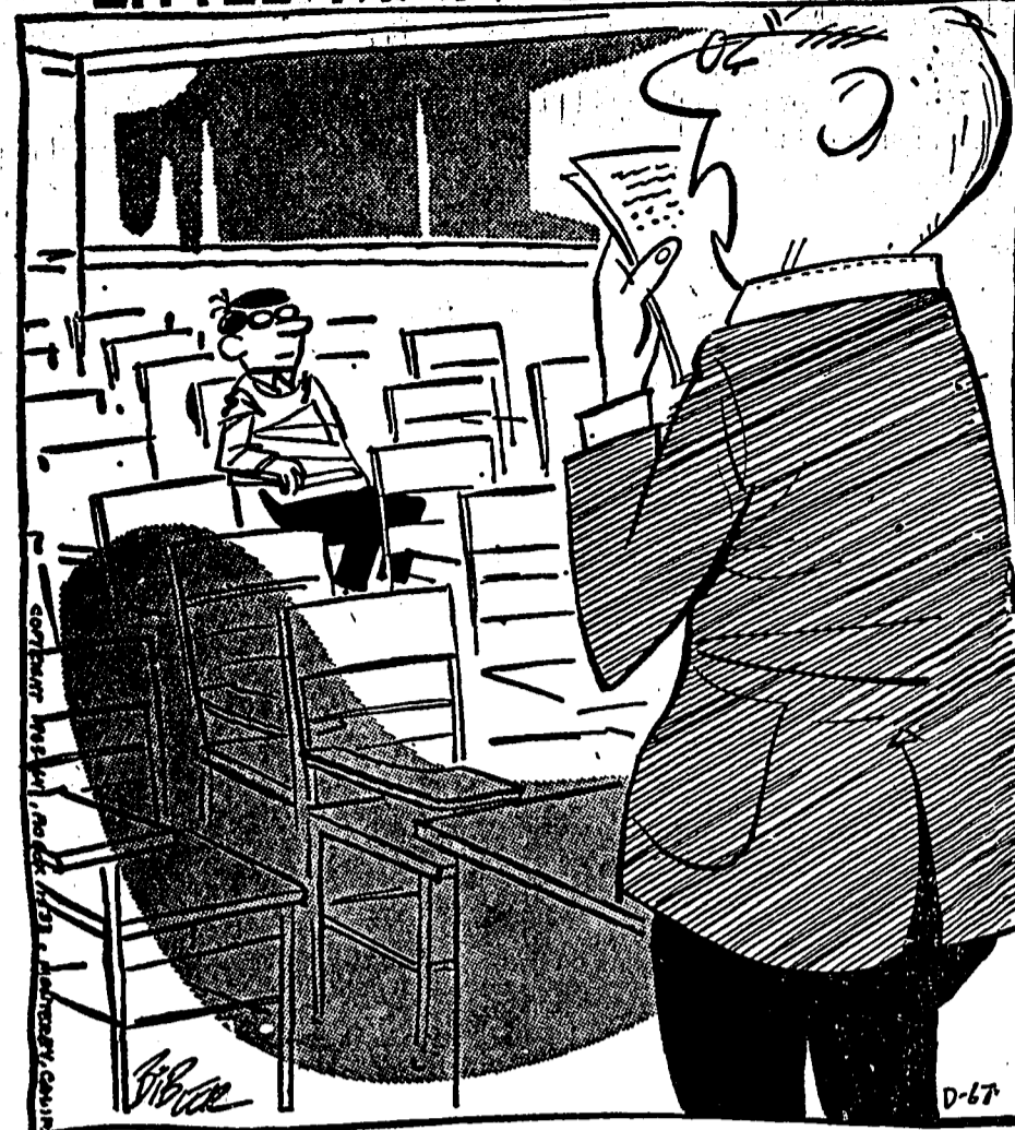
"CLASS, IT HAS BEEN BROUGHT TO MY ATTENTION THAT WE SHOULD REVIEW SCHOOL POLICY ON CLASS 'CLITS'."