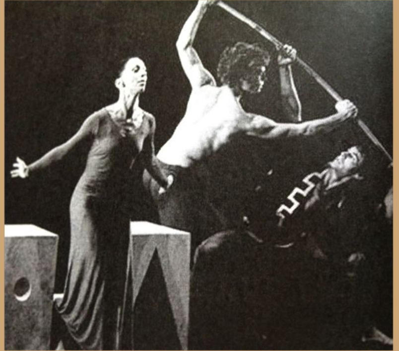
Naharin in Graham's Dream (1974)