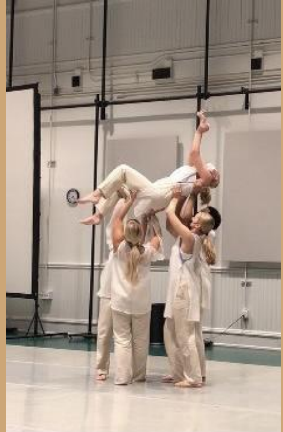
Slippery Rock University Dancers