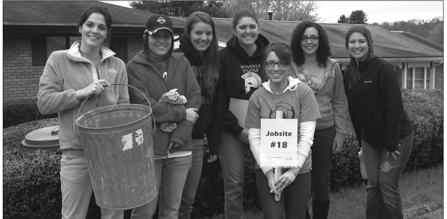
On Saturday more than 350 Cal U students will say 'thank you' to the borough of California by participating in The Big Event and performing a variety of tasks such as painting, yard work and cleaning.

"It's a great opportunity for our students to go out and really make a difference to individual community