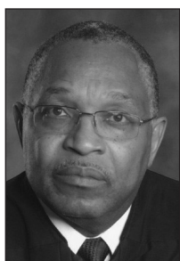
District Judge Reggie B. Walton

Previously, Walton served as an associate judge of the Superior Court of the District of Columbia, from 1981-1989 and 1991-2001. While on that court, he served as presiding judge of the Family Division, presiding judge of the Domestic Violence Unit and deputy presiding judge of the Criminal Division.