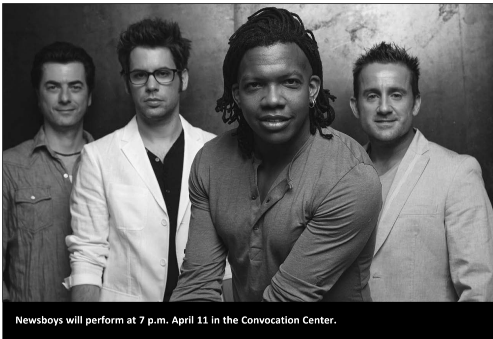
Newsboys will perform at 7 p.m. April 11 in the Convocation Center.

READ THE JOURNAL ONLINE: www.calu.edu/news/the-journal