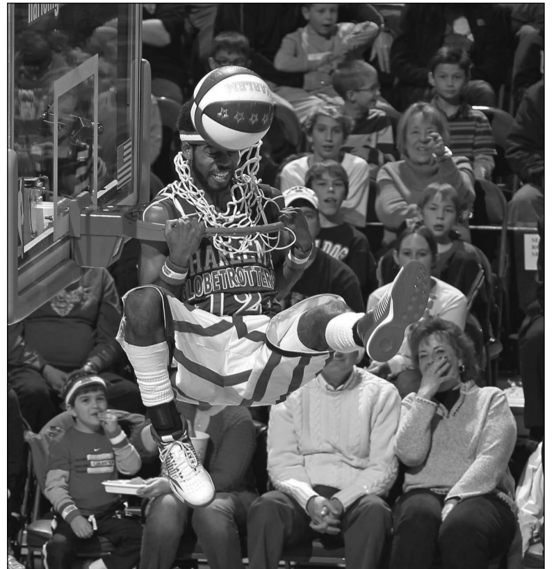
The Original Harlem Globetrotters will show off their trick shots, ball-handling wizardry and trademark sense of humor at 7 p.m. Thursday in the Convocation Center.

The Convocation Center Box Office phone is 724-938-4600. To order tickets by phone from Ticketmaster, call 800-745-3000, or order online at www.ticketmaster.com .