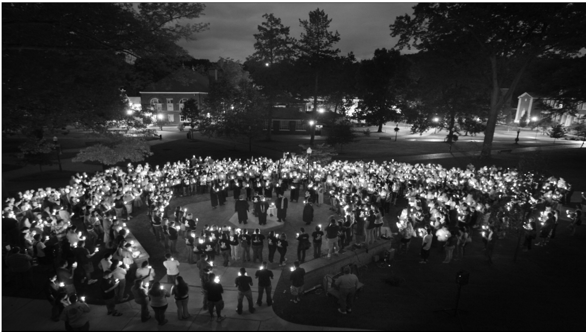
First-year students participate in a candlelight vigil in the Quad as part of their first weekend on campus. The students spent the first four days learning about the University through the Cal U for Life orientation program.