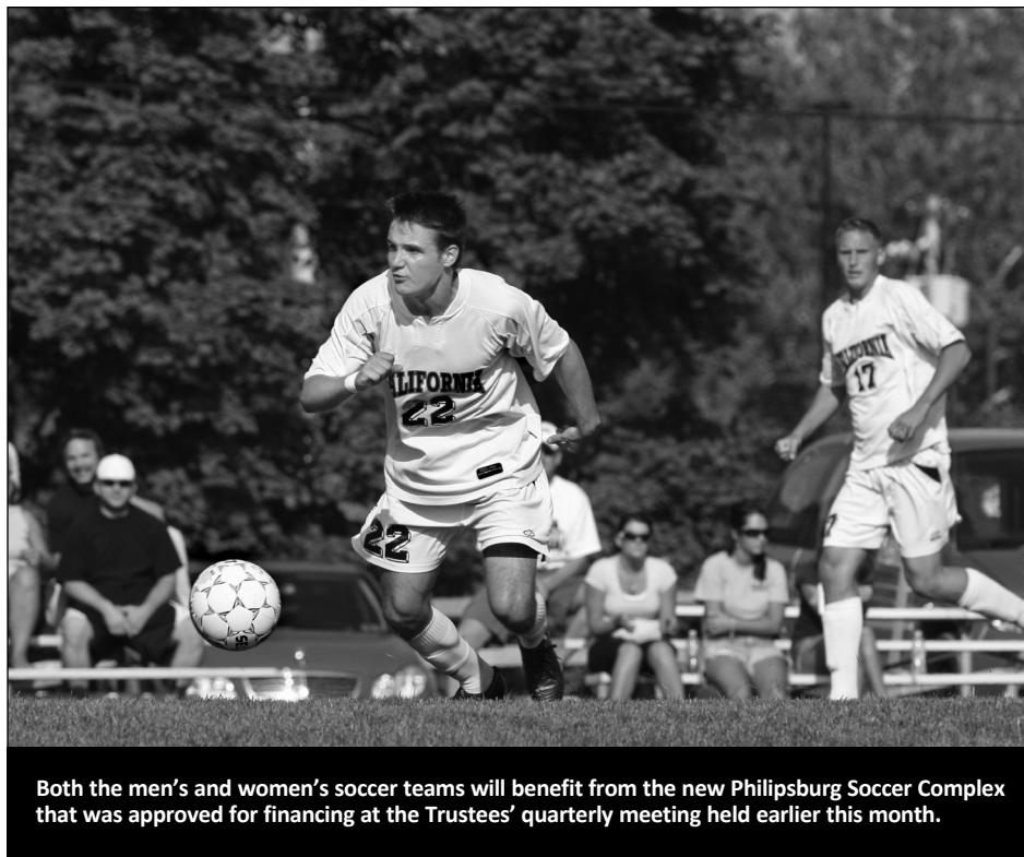
Both the men's and women's soccer teams will benefit from the new Philipsburg Soccer Complex that was approved for financing at the Trustees' quarterly meeting held earlier this month.

baseball practice field, which was removed during construction of the Roadman Park Lot that opened last fall. The Vulcans baseball team will