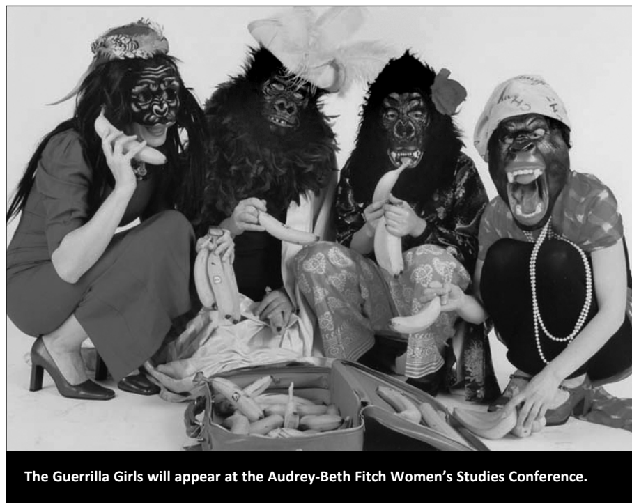
The Guerrilla Girls will appear at the Audrey-Beth Fitch Women's Studies Conference.

The work of these "feminist masked avengers" has been highlighted on the BBC and National Public Radio, as well as in The New York