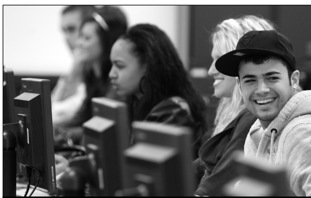
Student Tech Support is now in Room 219 in Noss Hall.