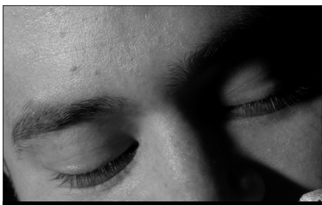
The Wildlife Society will present a Family Field Day Sept. 19.