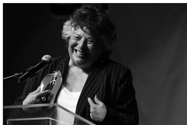
As part of Cal U's inaugural Native American Day on Nov. 9, Dr. LaDonna Harris, president of Americans for Indian Opportunity, will return to campus for THE third time and participate in a series of events.

The AIO Ambassadors will hold an open forum for