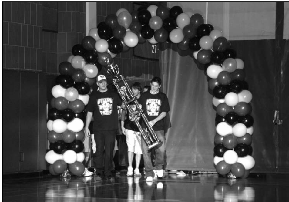
Cal U's hockey team, which compiled a school-best 29-1 record while reaching the national quarterfinals, was one of the teams honored during the third annual Vulcan Pride Celebration.

"Converting to this robust, web-based information management system ultimately will pay off in greater efficiency for students, faculty and staff," he said. "This is a complex and time-consuming project, and I appreciate all those who are working hard to make it successful."