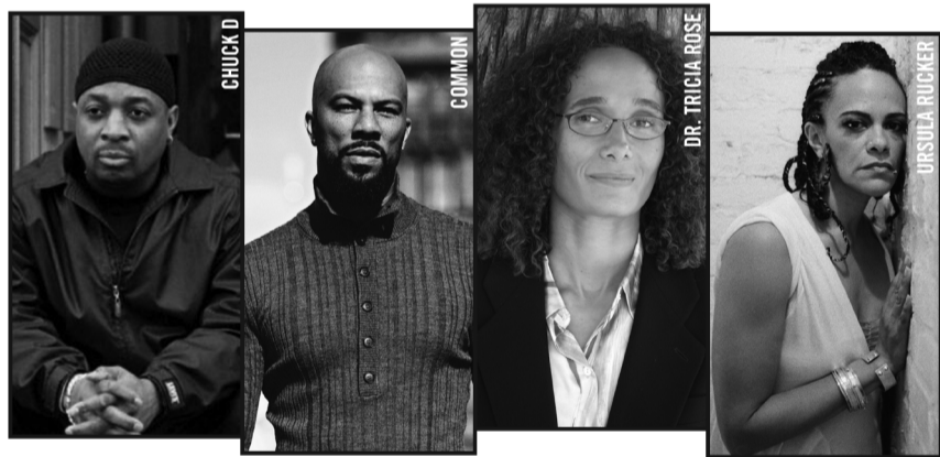
The fourth annual Hip-hop Conference features critically acclaimed artists and a nationally known educator.