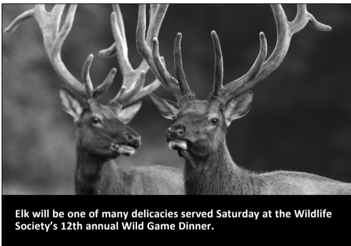
Elk will be one of many delicacies served Saturday at the Wildlife Society's 12th annual Wild Game Dinner.