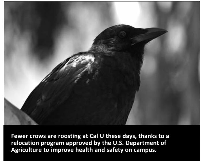
Fewer crows are roosting at Cal U these days, thanks to a relocation program approved by the U.S. Department of Agriculture to improve health and safety on campus.

By the time classes resumed, campus sidewalks were