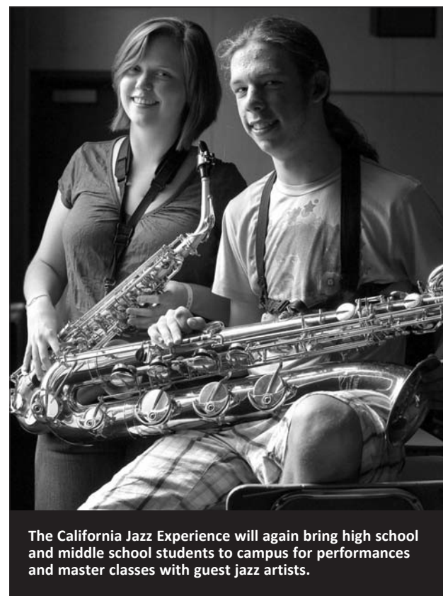
The California Jazz Experience will again bring high school and middle school students to campus for performances and master classes with guest jazz artists.

For more information, contact the Cal U Music Department at 724-938-4878.