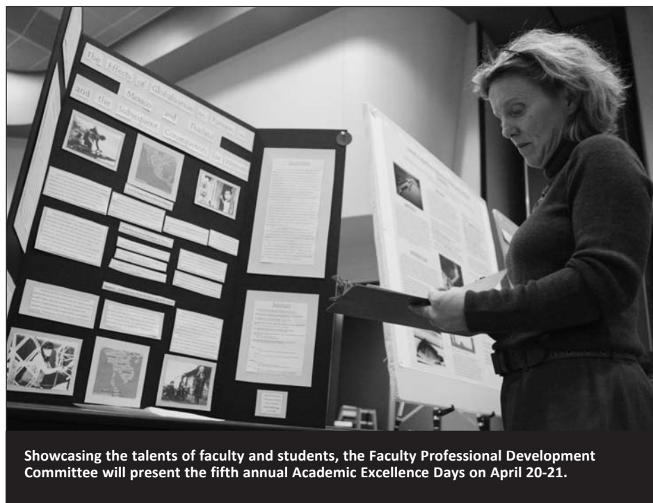
Showcasing the talents of faculty and students, the Faculty Professional Development Committee will present the fifth annual Academic Excellence Days on April 20-21.

The Academic Excellence program, initiated by and supported through the