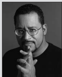
Michael Eric Dyson

Dr. Michael Eric Dyson and Doug E. Fresh headlining the event.