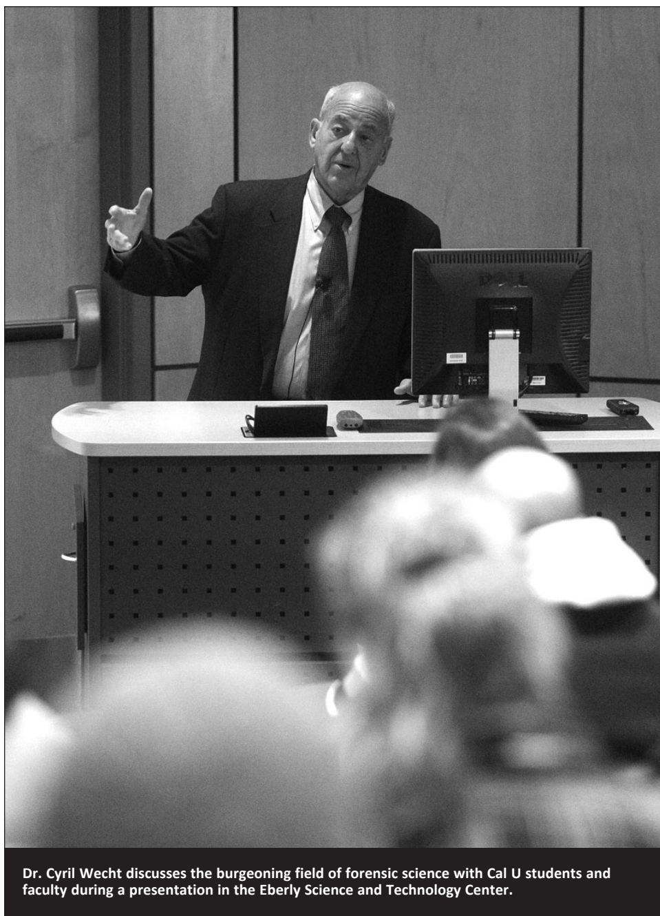
Dr. Cyril Wecht discusses the burgeoning field of forensic science with Cal U students and faculty during a presentation in the Eberly Science and Technology Center.