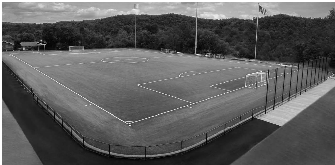
A dedication for the new Phillipsburg Soccer facility will be held Saturday at 1 p.m. in between games against East Stroudsburg.

Read the Journal online: www.calu.edu/news/the-journal