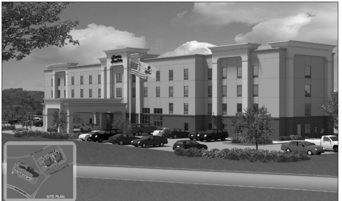
The artist's rendering of the Hampton Inn and Suites hotel, which will be built at California Technology Park about 2 miles from the Cal U campus.

Organized by the American Democracy Project, the program was co-sponsored by the Office of the President; Academic Affairs/Office of the Provost; the College of Education and Human Services; the College of Liberal Arts; the Department of Early, Middle and Special Education; and the Department of History and Political Science.