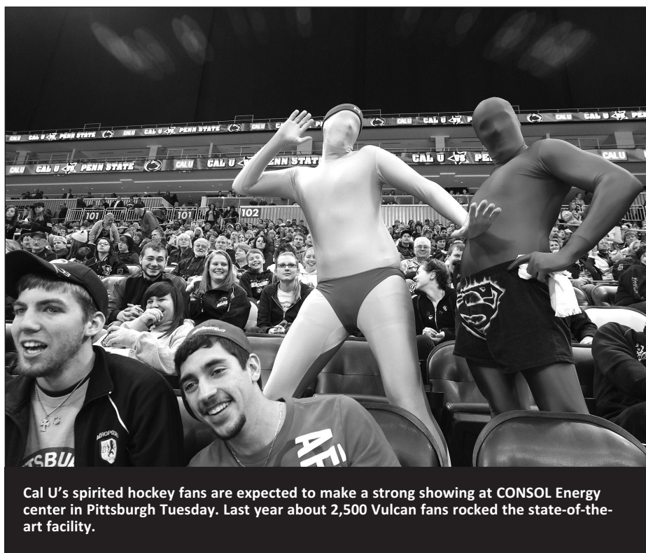
Cal U's spirited hockey fans are expected to make a strong showing at CONSOL Energy center in Pittsburgh Tuesday. Last year about 2,500 Vulcan fans rocked the state-of-the-art facility.

may ride a fan bus from the Natali Student Center parking lot to CONSOL Energy Center. Check the Cal U website, www.calu.edu , for details about departure times and registering to ride.