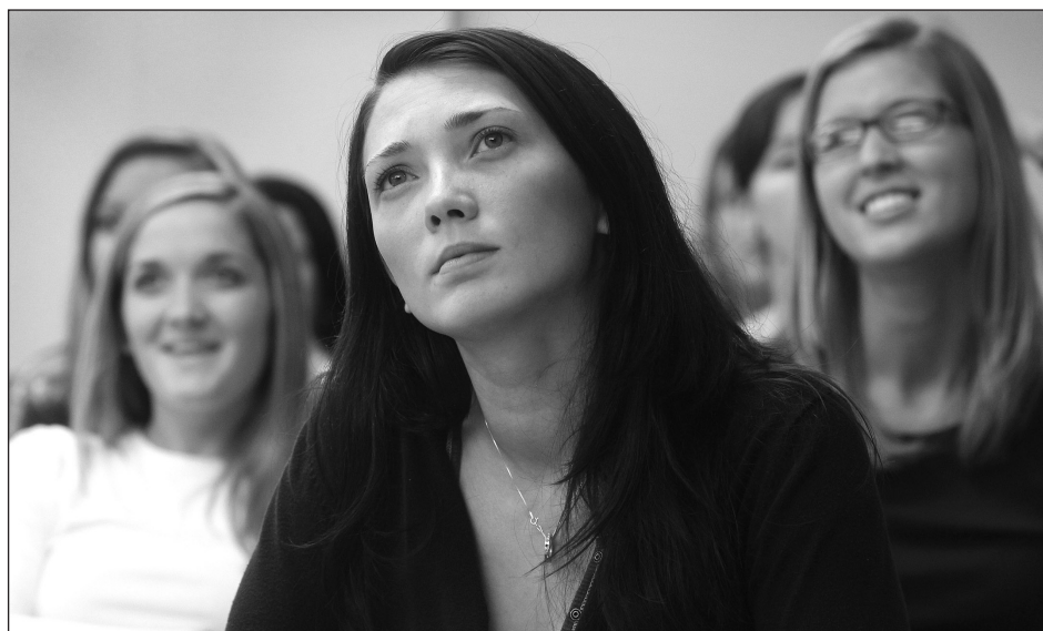
Students will receive valuable information on the advantages, program options and cost effectiveness of earning a master's degree when the School of Graduate Studies and Research holds an open house from 10 a.m.-2 p.m. Saturday at the Cal U Southpointe Center.

assistantships, scholarships and financial aid can reduce the cost of earning an advanced degree.