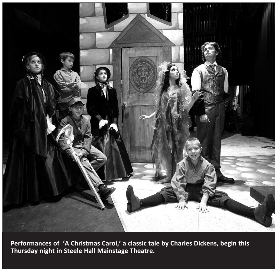
Performances of 'A Christmas Carol,' a classic tale by Charles Dickens, begin this Thursday night in Steele Hall Mainstage Theatre.

For ticket information, or to order tickets by phone, call the Steele Box Office at 724-938-5943.