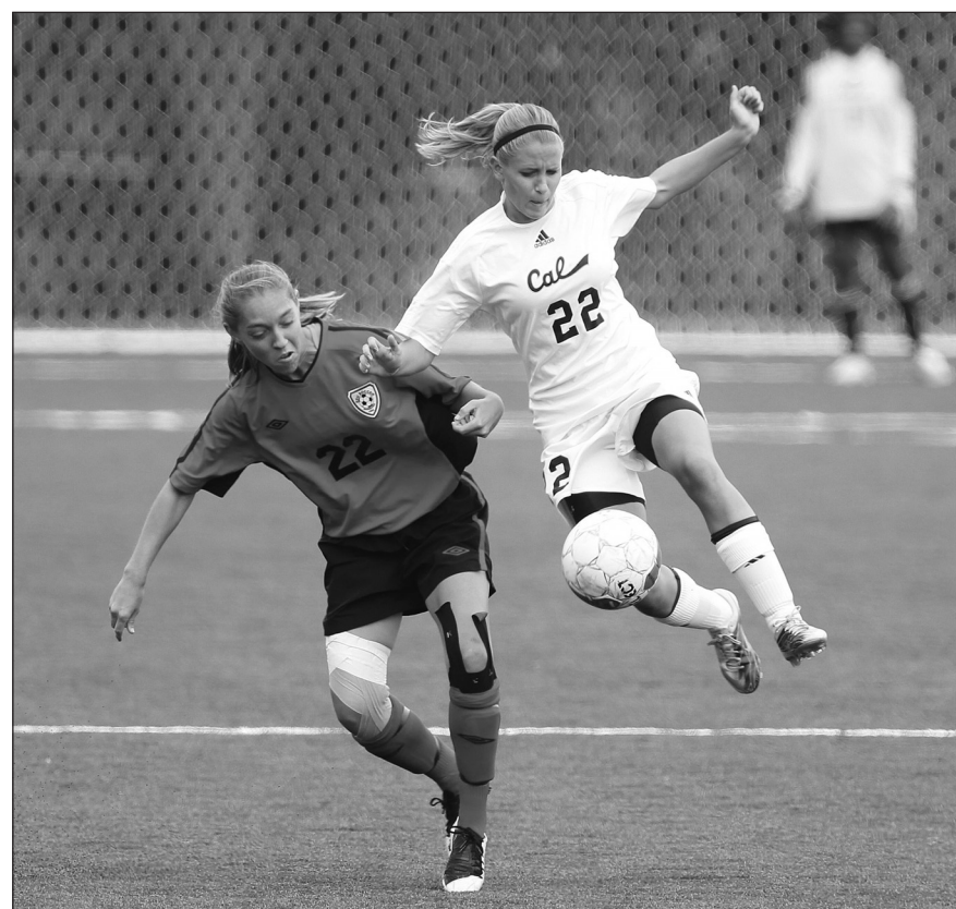
Cal U's athletics leads the Dixon Trophy standings and ranks third in the national Directors' Cup. The women's soccer team contributed to this success by winning the PSAC title and advancing to the NCAA Division II quarterfinals this past fall.

Announced through the National Association of Collegiate Directors of Athletics, the Learfield Sports Directors' Cup annually honors institutions maintaining a broad-based program in both men's and women's sports. The scoring system