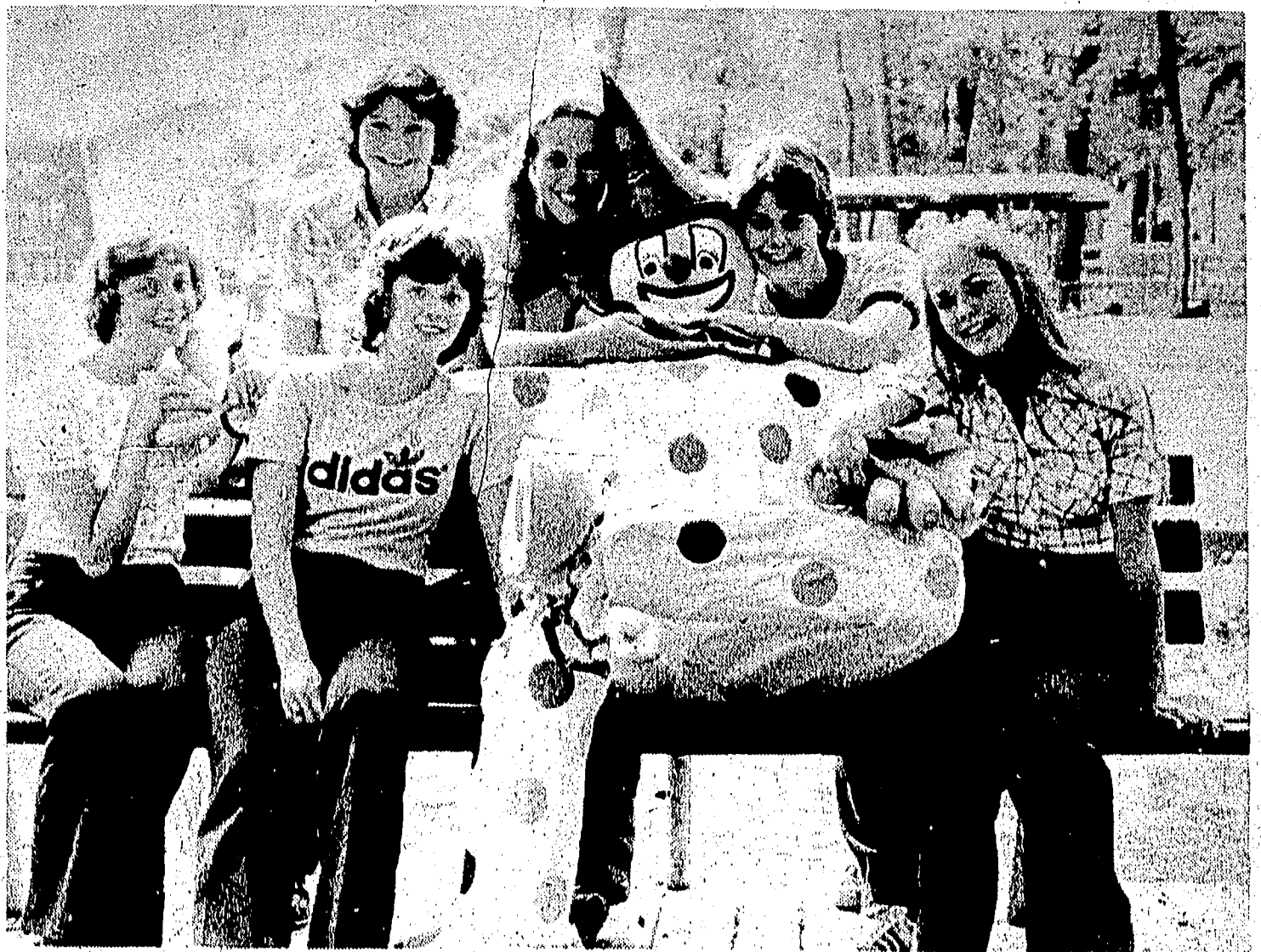
AH YES, THE THINGS idle hands find to do...These students have managed to befriend a Knoebel clown at Saturday's picnic.

The researchers will attempt to detect people having high blood pressure (hypertension) who aren't being treated so that they can seek medical aid. The students hope to compile statistics in order to determine the causes for the sickness and the area where it is most prevalent.